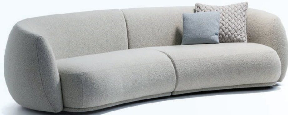
3 Seater Cambered Sofa