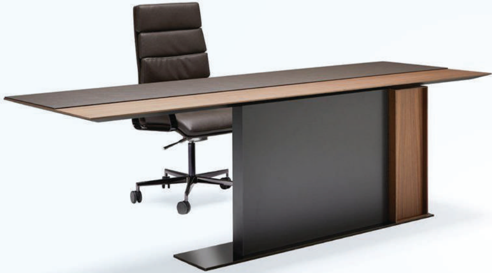
Executive Desk With Drawers STO-TD006WD