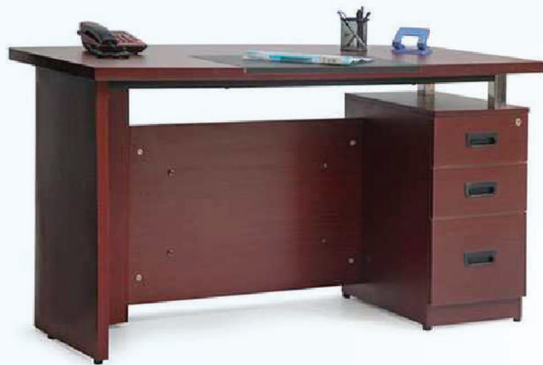
Executive Table STO-OET013LB