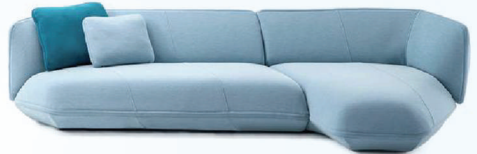
3 Seater Crooked Sofa