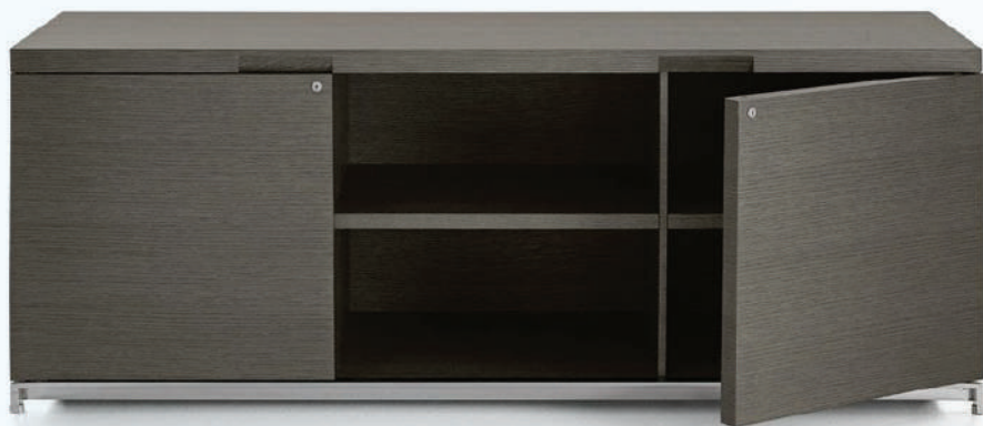
Low Height Cabinet STO-OS320LB