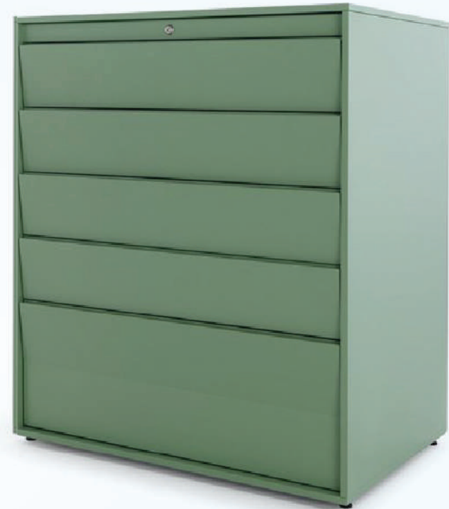
Drawer Unit STO-0F373MS