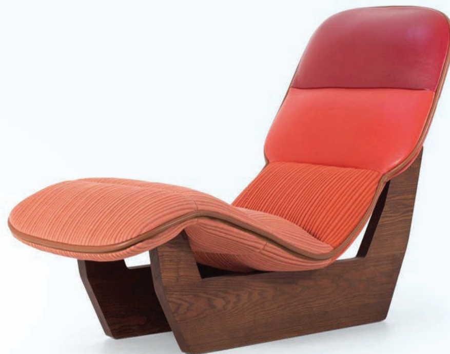
Arm Chair STO-CC203FF