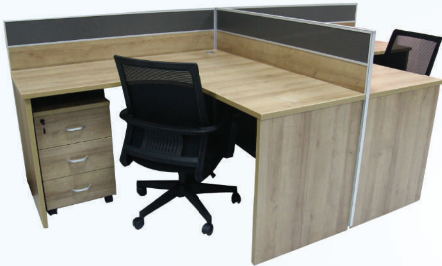
Office Work Station STO-OD020LB