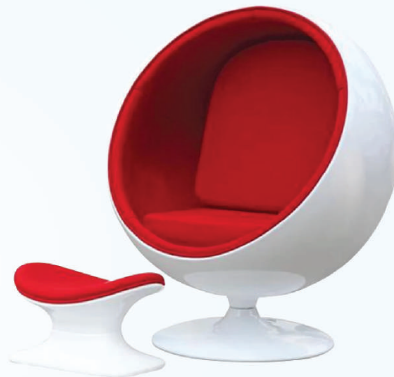
Arm Chair STO-CC210FF