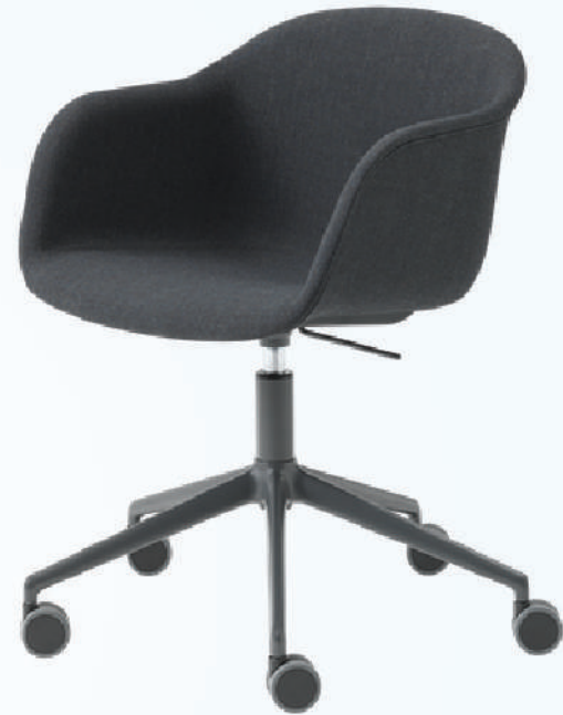
Executive Chair STO-CC078F