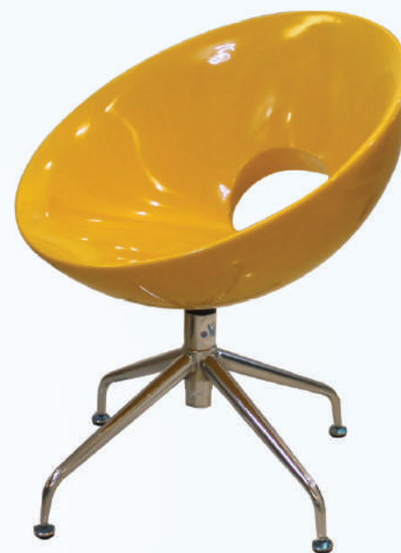
Executive Chair STO-CC076P