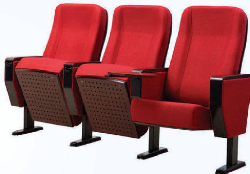
Auditorium chair STO-WB437FF