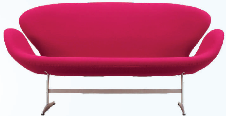
Mid Century Sofa