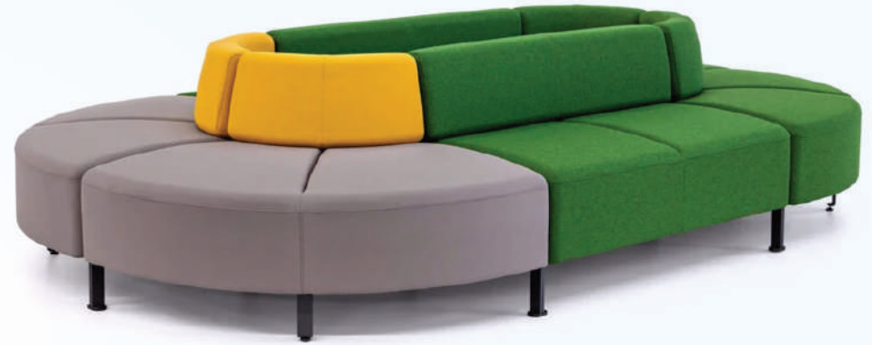
Modular Bench STO-WB436FF