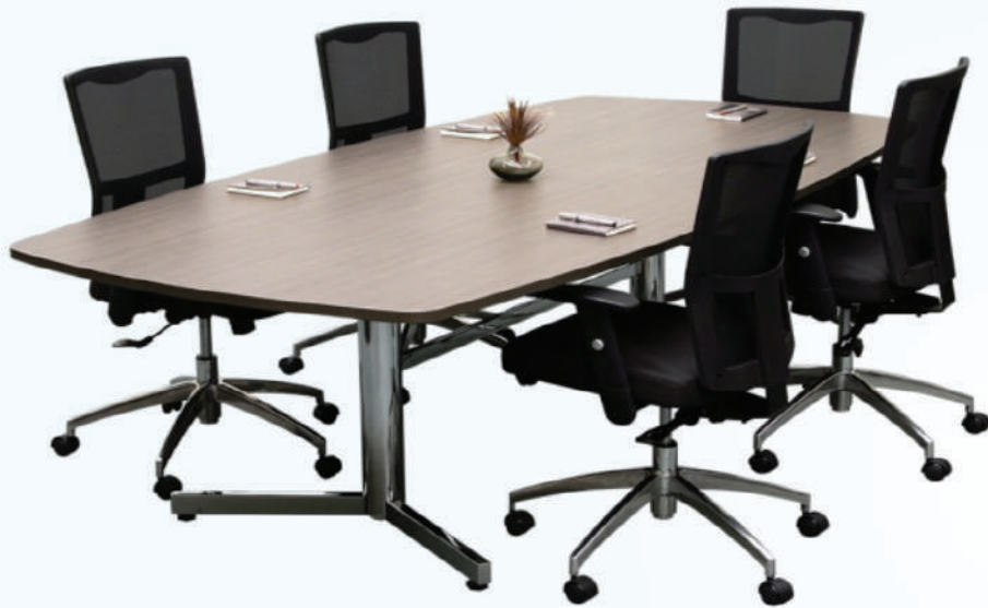
Conference Table STO-CT420LB