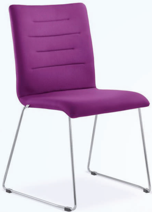
Executive Chair STO-OVC0078FR