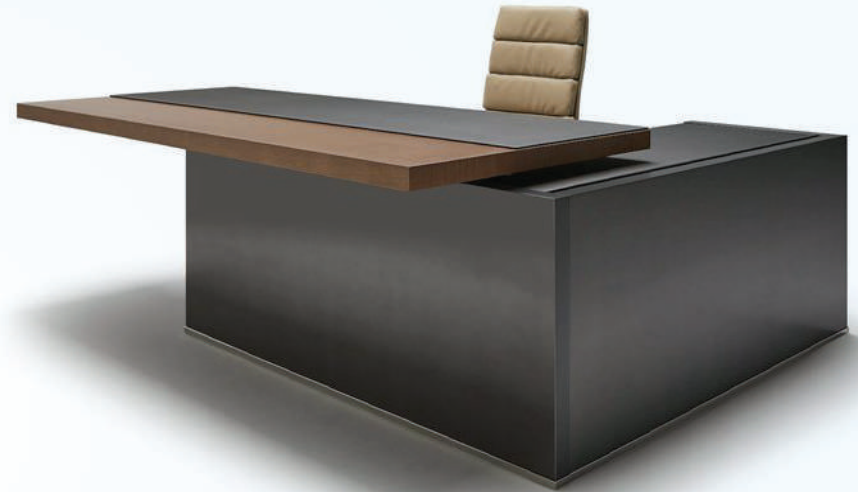
Executive Desk With Drawers STO-TD007WD