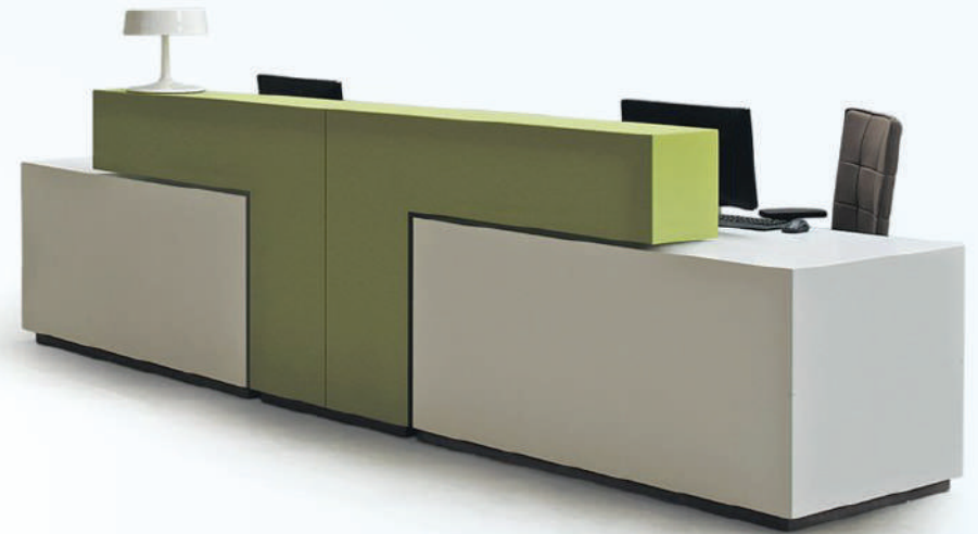
Reception Desk STO-00D405WD