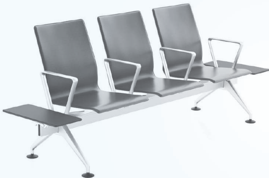
Waiting Bench STO-WC427WD