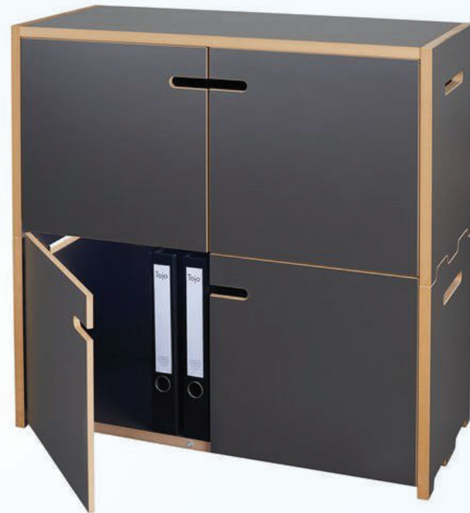
Side Rack STO-OR325LB