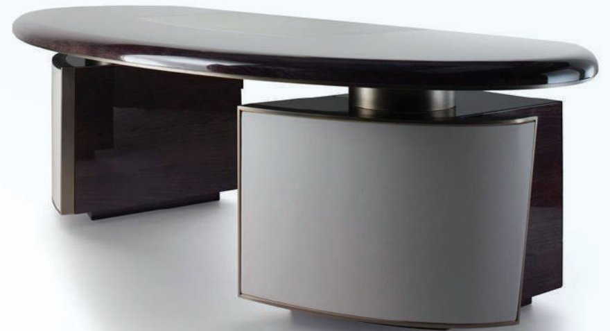
Executive Writing Desk STO-TD002WD