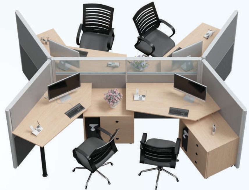
Office Work Station STO-OD021LB