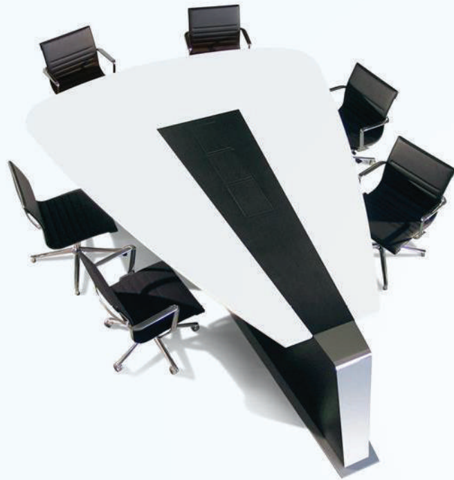
Conference Table STO-CT424WD