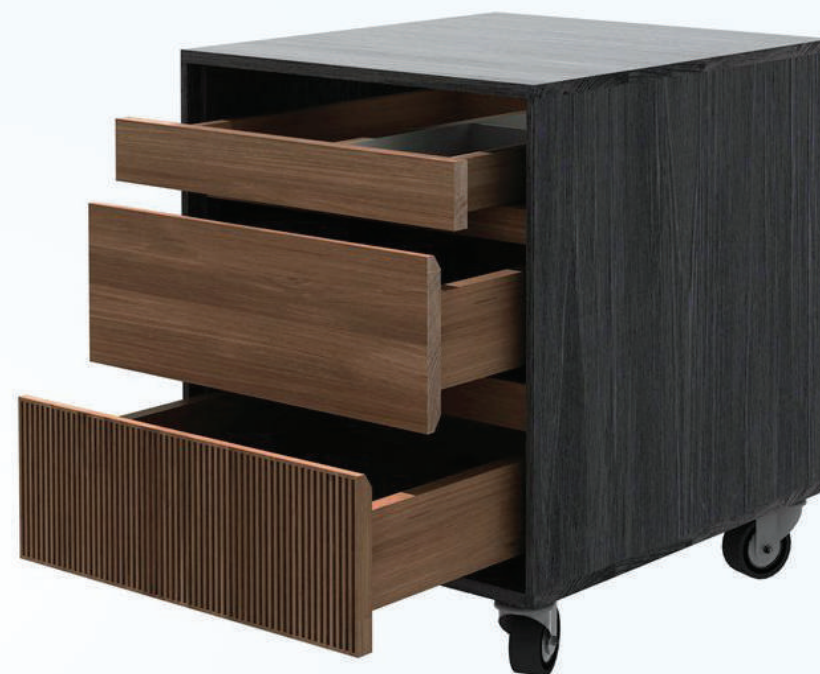
Movable Drawer Unit STO-0F371LB