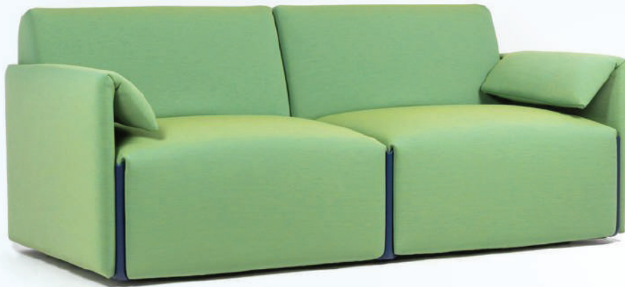
Love Seat sofa