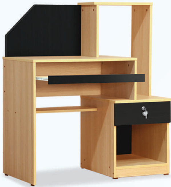
Computer Table STO-CT019LB