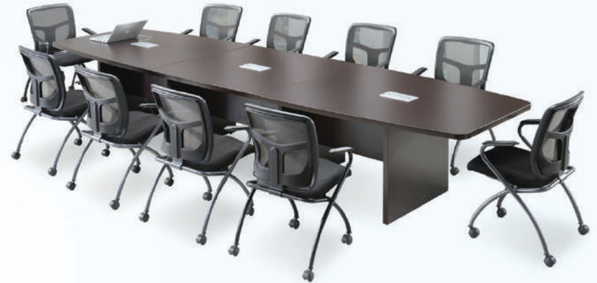
Conference Table STO-CT421LB