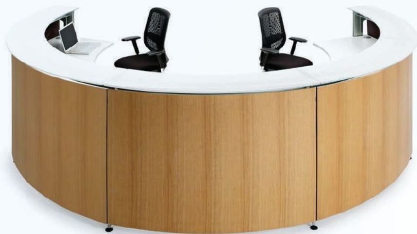
Modular Reception Desk STO-00D400LB