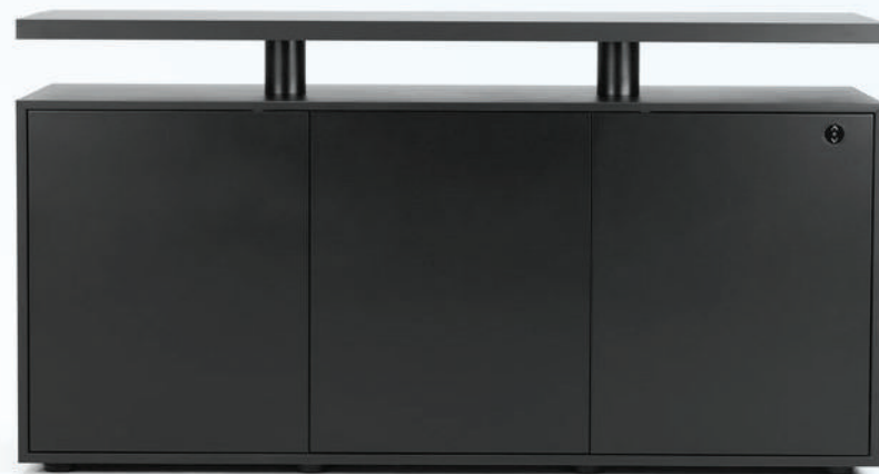
Side Table STO-OS321LB