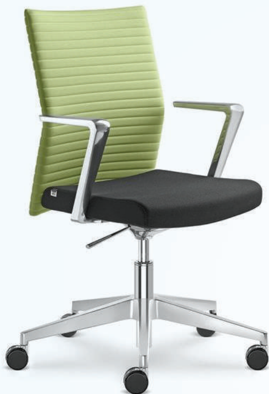
Executive Chair STO-OEC100FR