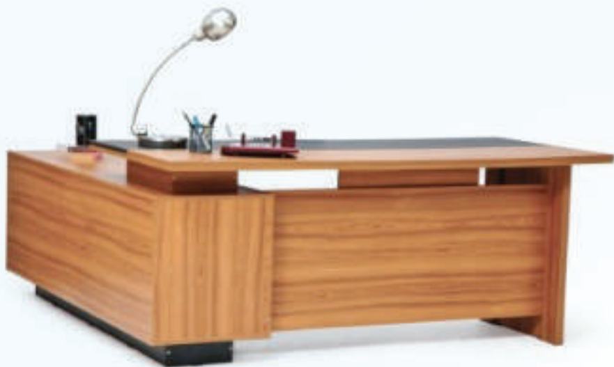
Executive Desk With Drawers STO-TM010LB