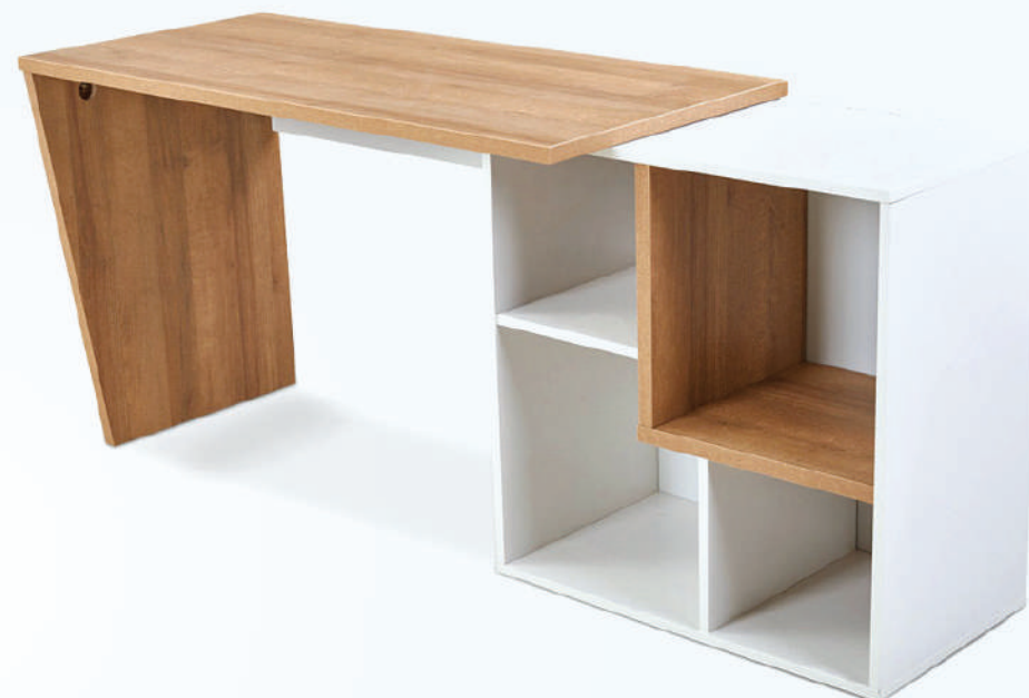
Computer Desk STO-CT018LB