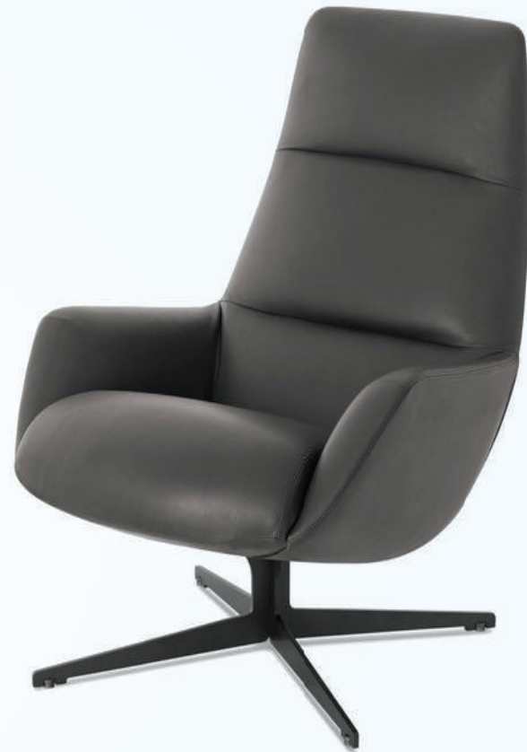
Executive Chair STO-CC201FR