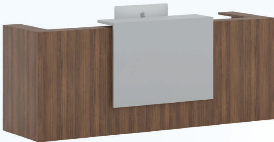
Reception Desk STO-00D402WD