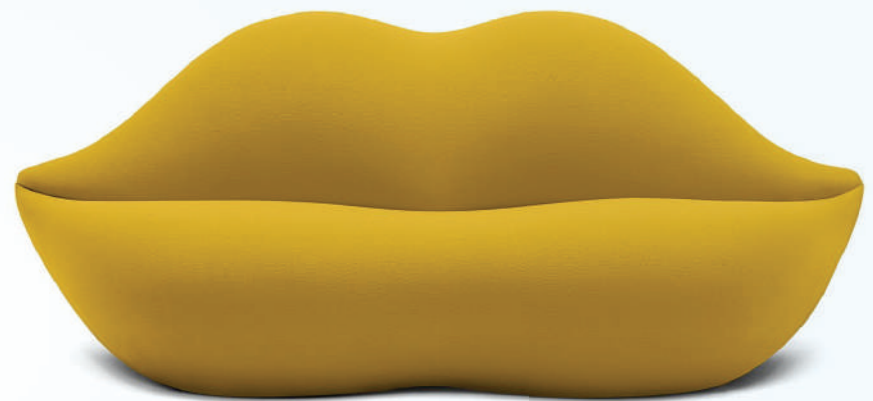
Lipseat Sofa STO-2-40F STO-2-40R