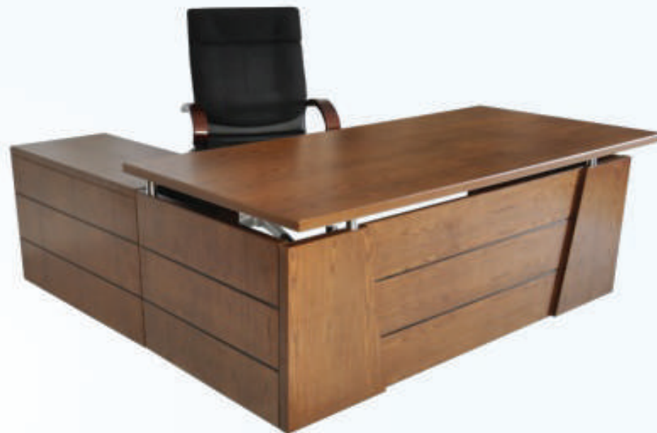
Manager Table With Drawers STO-TD011WD