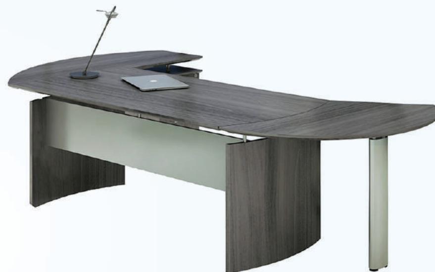
Executive Writing Desk STO-TD005WD