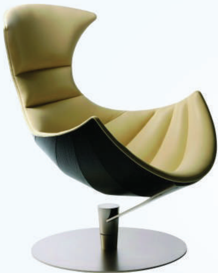
Arm Chair STO-CC205FF