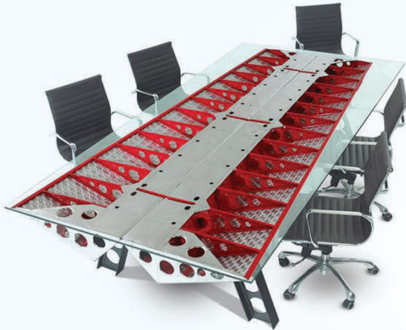
Conference Table STO-CT422MS