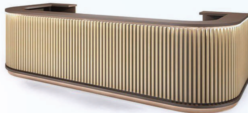
Reception Desk STO-00D403WD