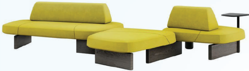
Waiting Bench STO-WC430FF