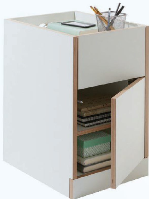
Drawer Unit STO-0F370LB