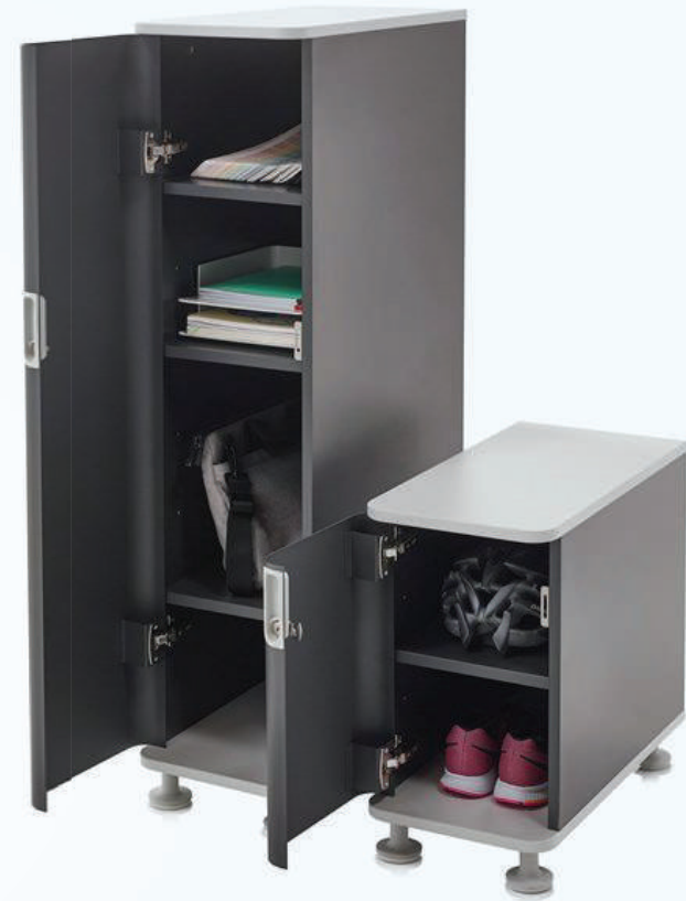
Office Storage STO-OS351MS