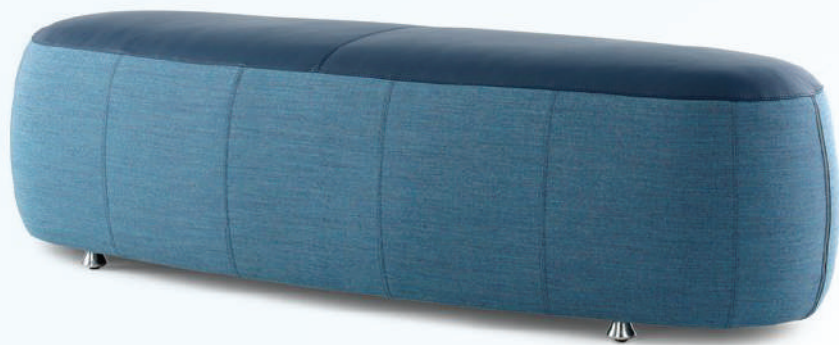
Upholstered Bench STO-WB435FF