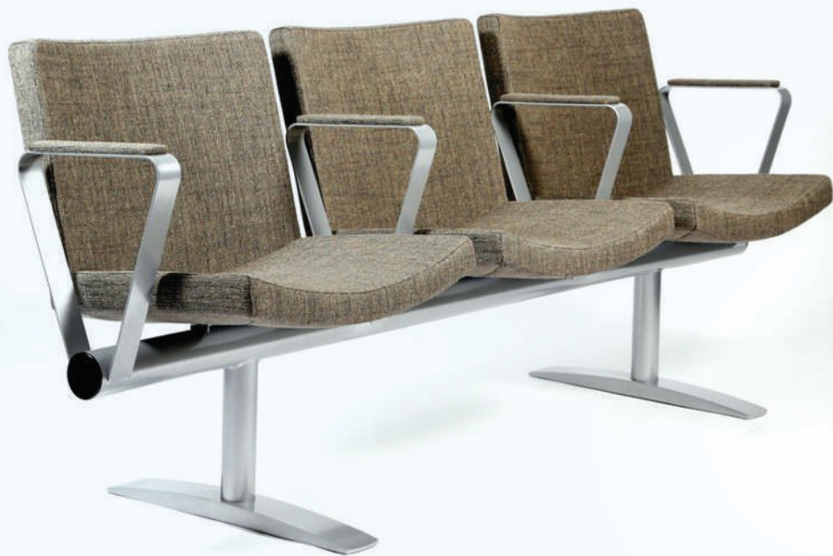
3-Seater Chair STO-WC425MS