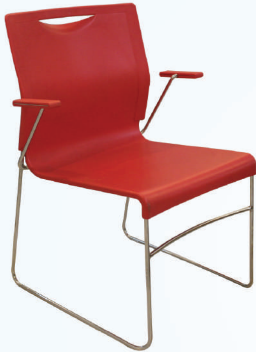
Executive Chair STO-OVC0077P