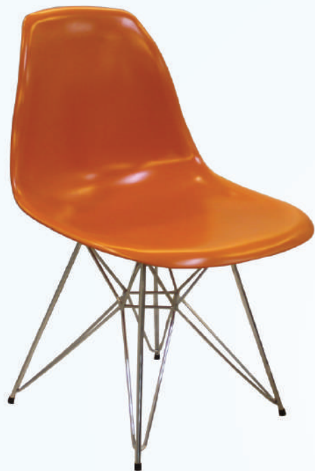
Executive Chair STO-CC075P