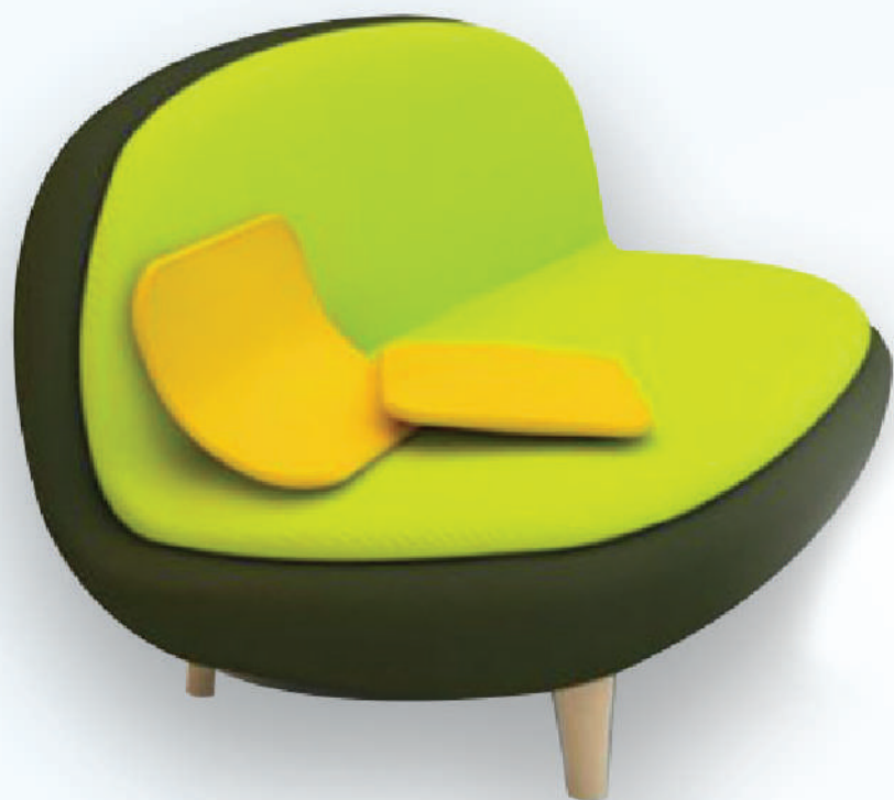
Arm Chair STO-CC209FF