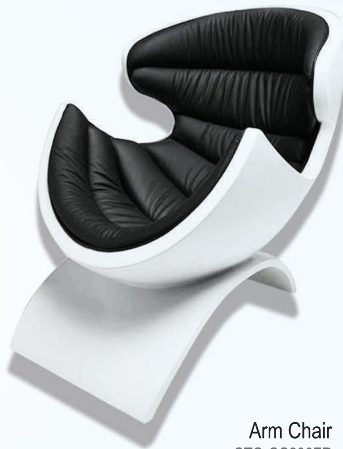
Arm Chair STO-CC206FR