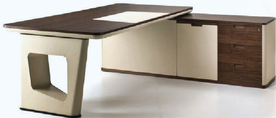
Corner Wooden Writing Desk STO-TD008WD