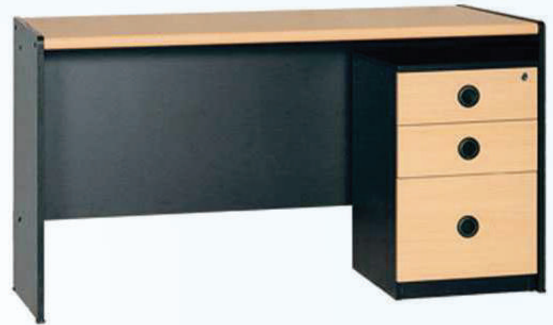
Executive Table STO-OET016LB