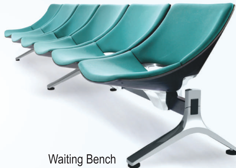
Waiting Bench STO-WC428WD