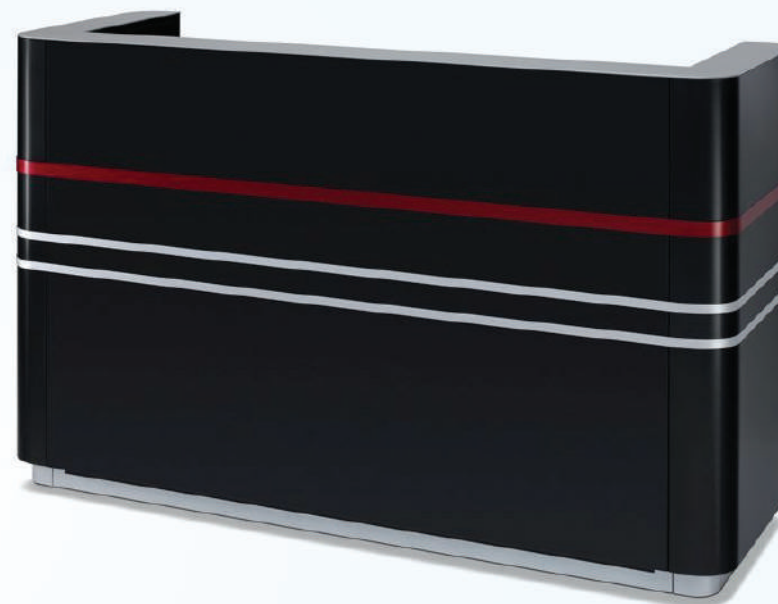
Reception Desk STO-00D401WD