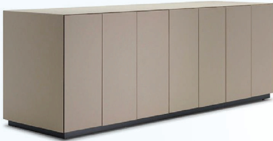
Low Height Cabinet STO-0S322LB