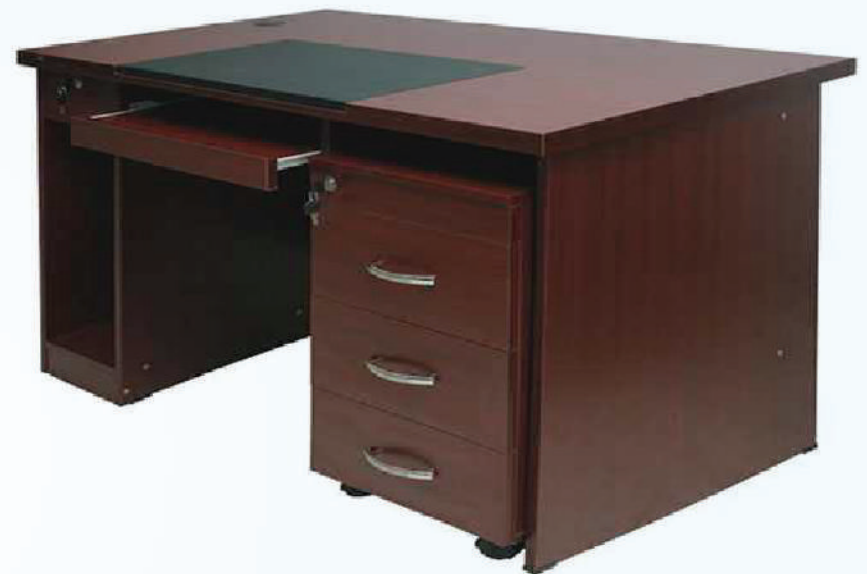
Executive Table STO-OET014LB