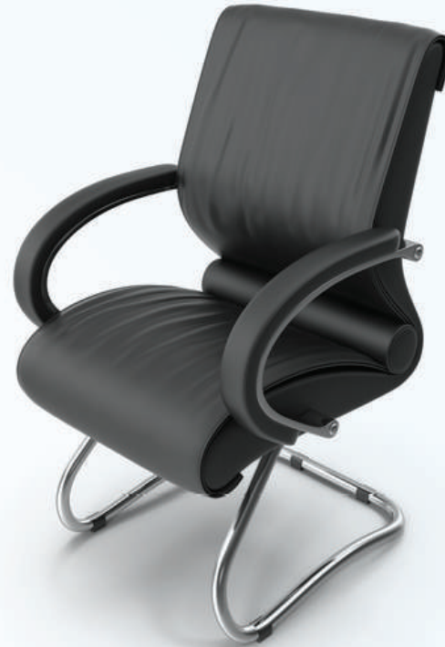
Executive Chair STO-OVC070R