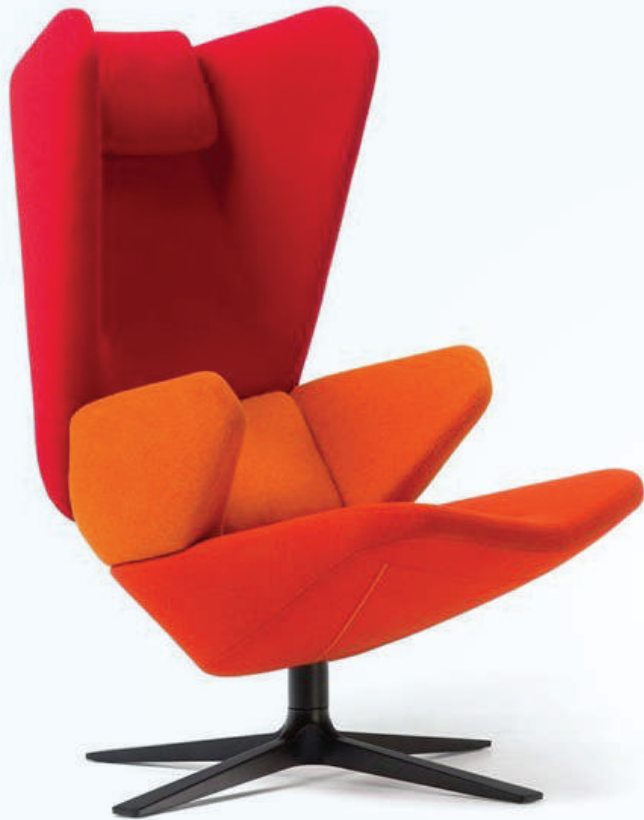
Executive Chair STO-CC200FF