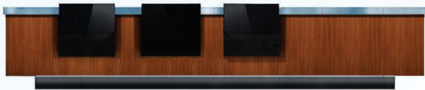
Reception Desk STO-00D4004WD