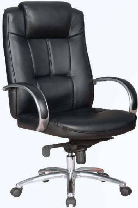
Executive Chair STO-ODC050R