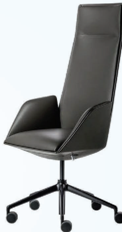
Executive Chair STO-ODC110FR