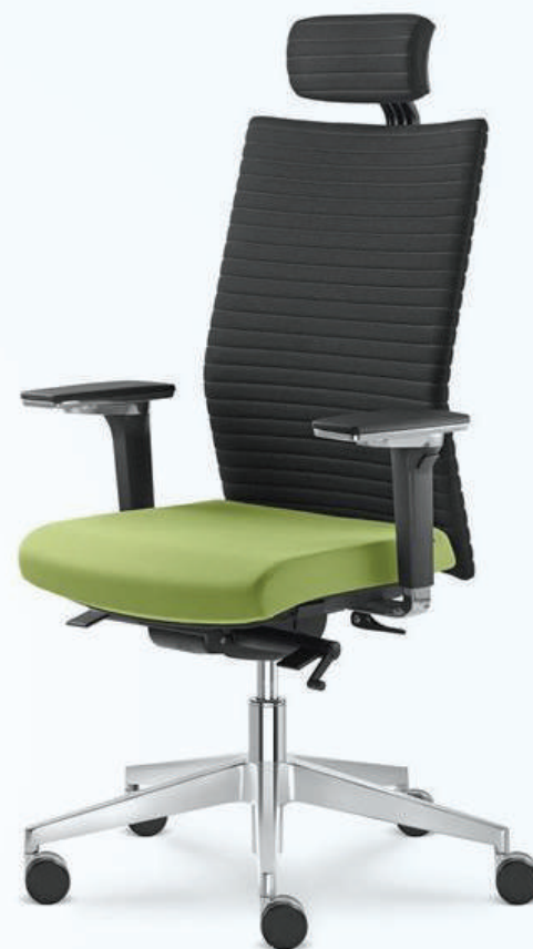
Executive Chair STO-OEC101FR