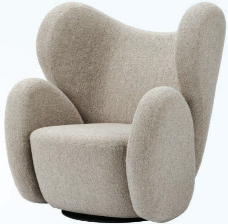
Arm Chair STO-SS301FF