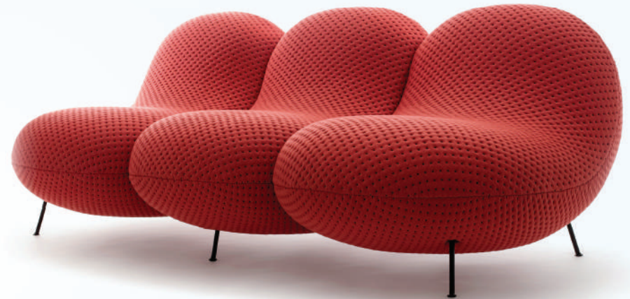
Imposing Sofa STO-30MF