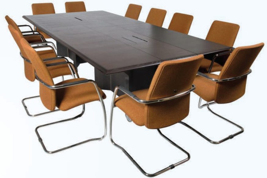
Conference Table STO-CT425WD