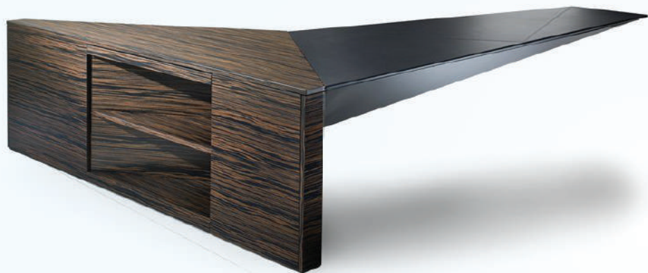
Corner Wooden Writing Desk STO-TD003WD