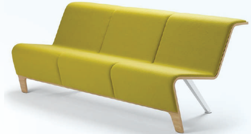
Waiting Bench STO-WC431FF