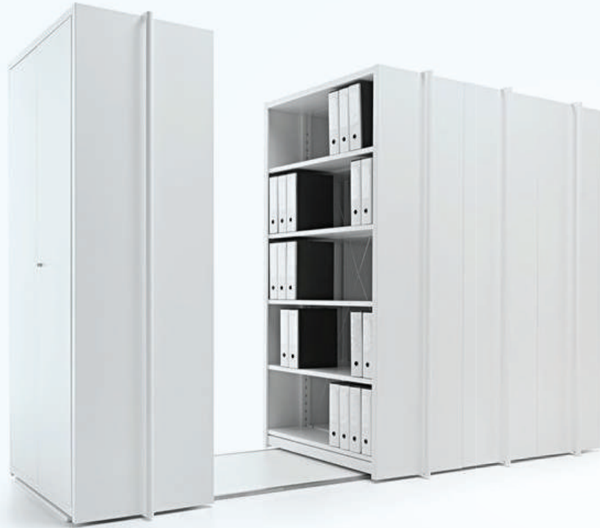
Compactable Cabinet STO-OS350MS