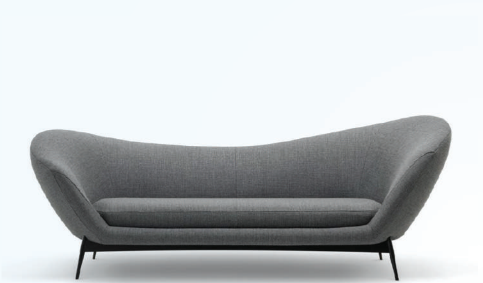
21st Century Sofa