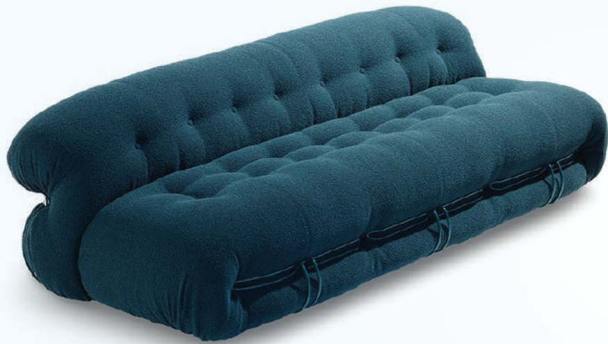
Sleeper sofa STO-3-38F STO-3-38R