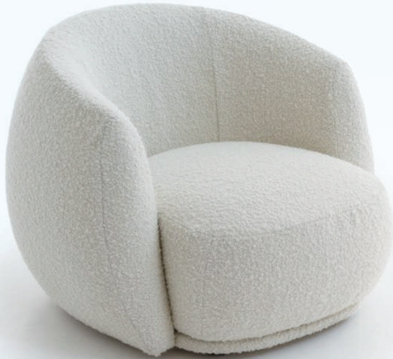
Arm Chair STO-SS300FF