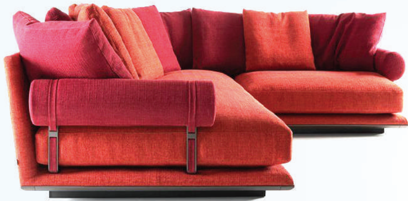
Sectional Sofa STO-25F STO-25LR