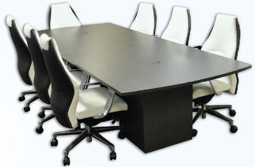
Conference Table STO-CT423WD