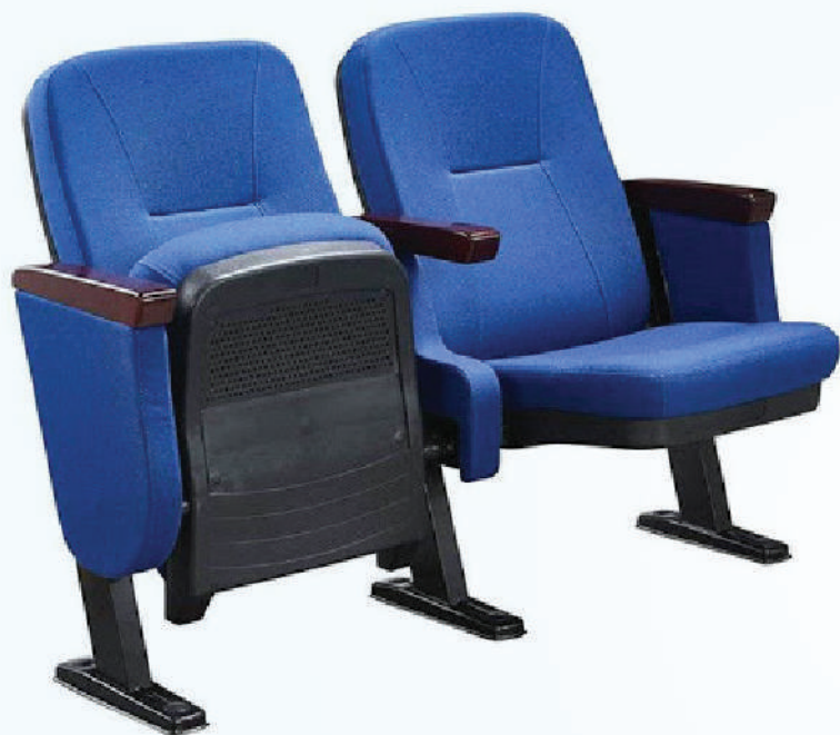
Auditorium chair STO-WB436FF