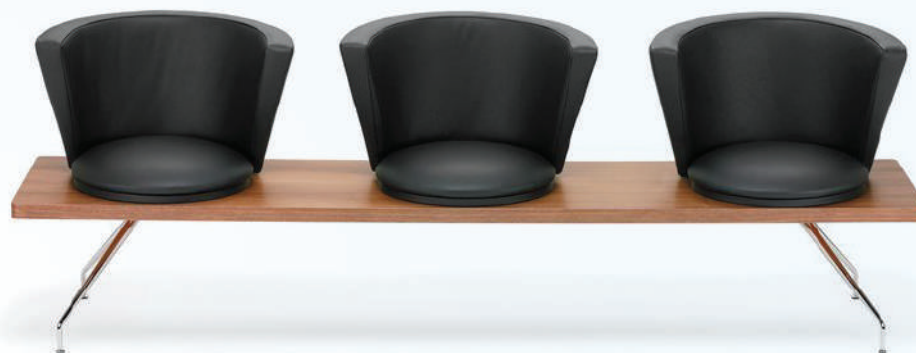
3-Seater Chair STO-WC426WD