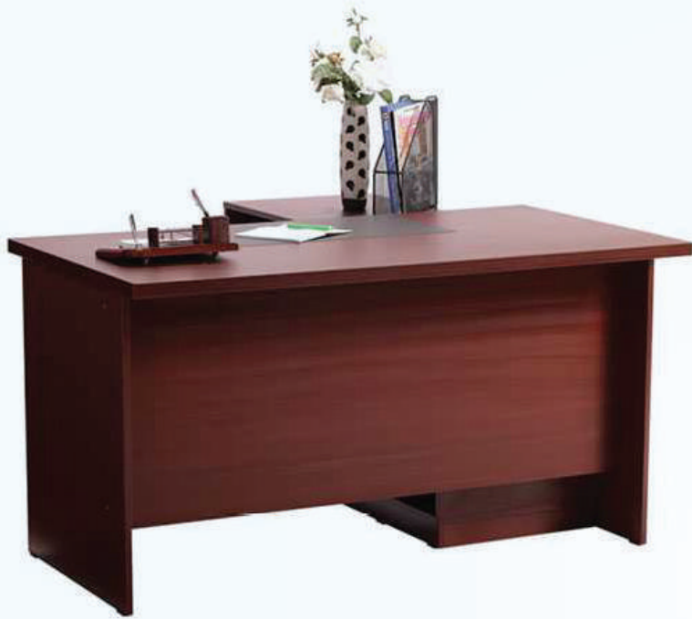
Executive Table STO-OET015LB