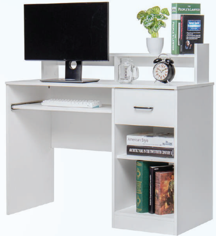
Damarion Desk With Hutch STO-CT020LB