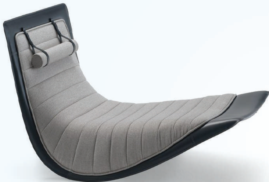
Arm Chair STO-CC202FF