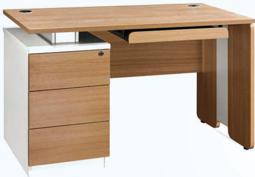
Executive Table STO-OET017LB