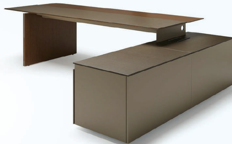
Executive Writing Desk STO-TD009WD