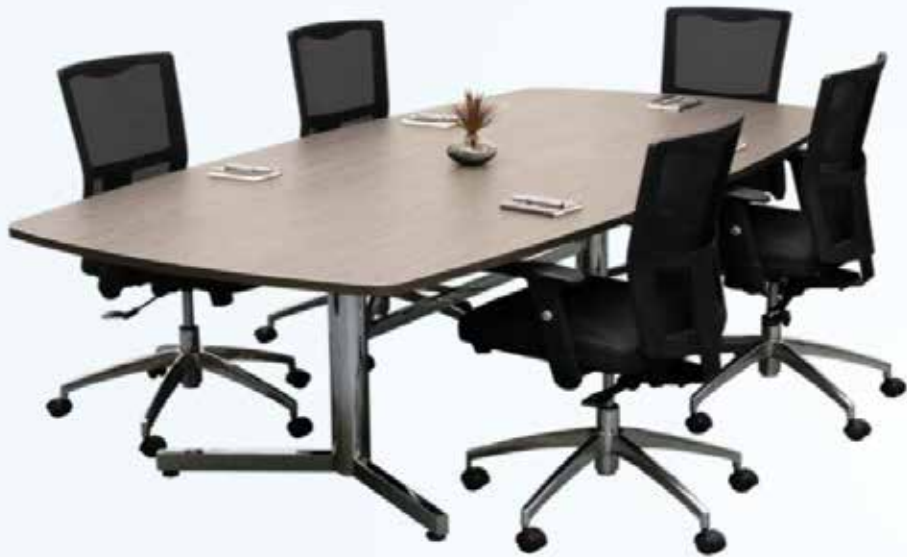
Conference Table STO-CT420LB