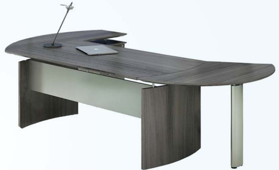
Executive Writing Desk STO-TD005WD