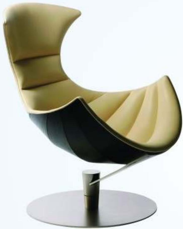
Arm Chair STO-CC205FF