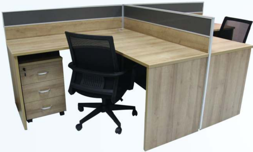
Office Work Station STO-OD020LB