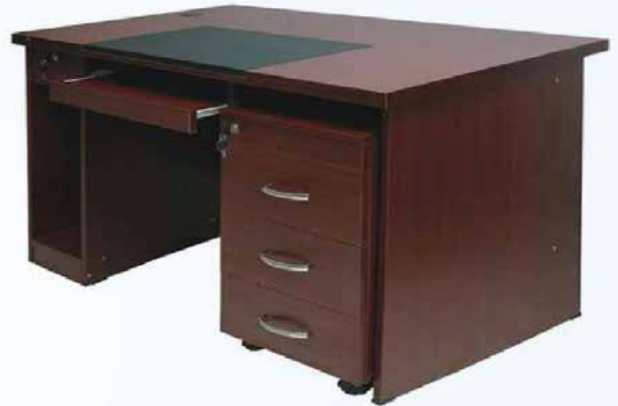
Executive Table STO-OET014LB