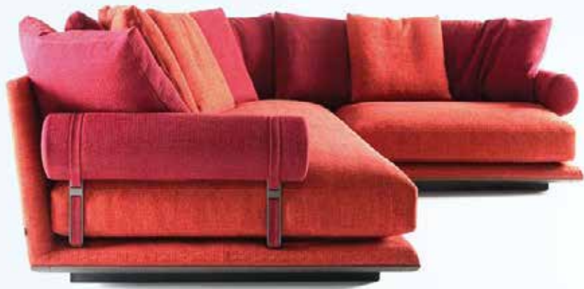
Sectional Sofa STO-25F STO-25LR