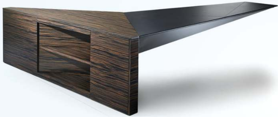
Corner Wooden Writing Desk STO-TD003WD