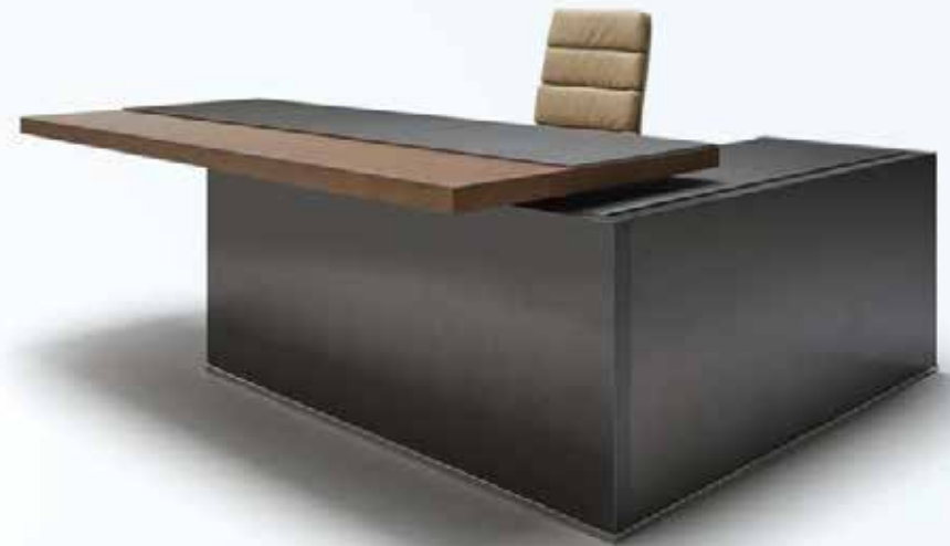
Executive Desk With Drawers STO-TD007WD