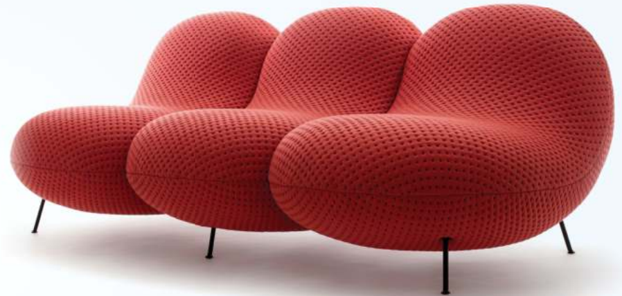
Imposing Sofa STO-30MF