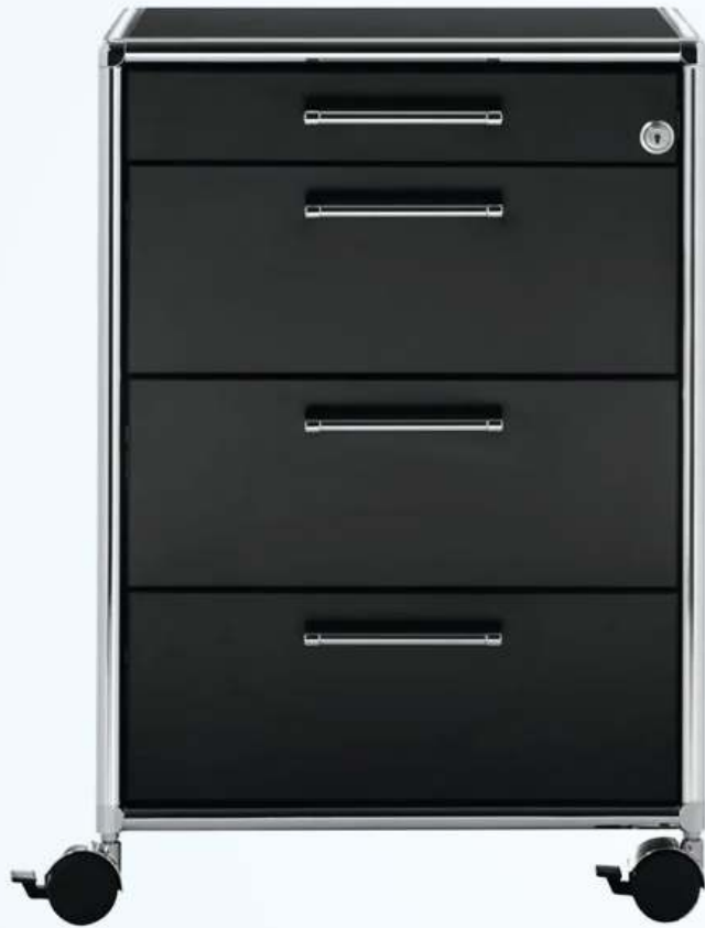
Movable Drawer Unit STO-0F372LB