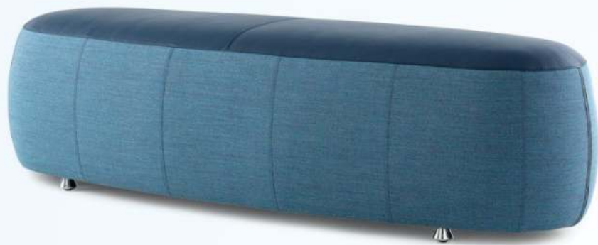
Upholstered Bench STO-WB435FF