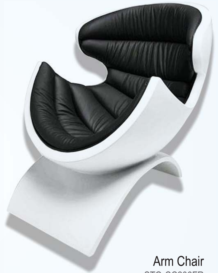
Arm Chair STO-CC206FR