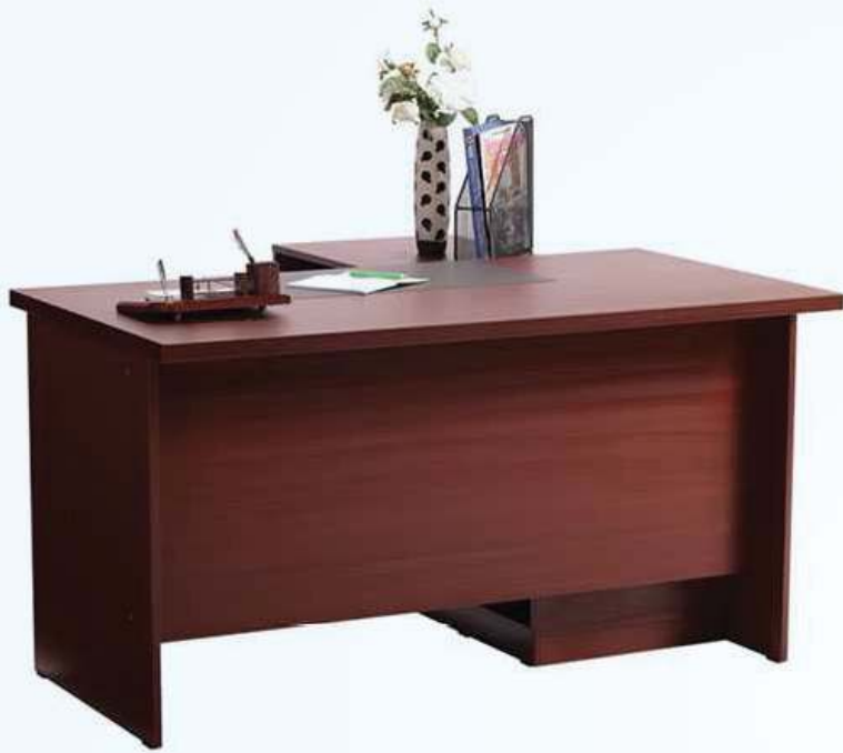
Executive Table STO-OET015LB