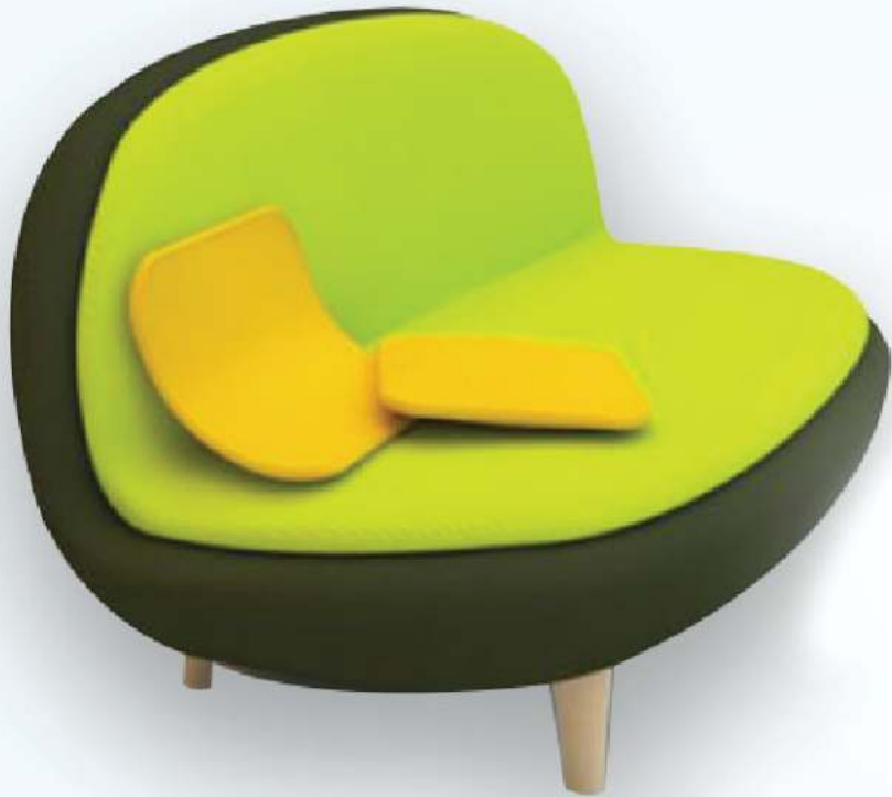
Arm Chair STO-CC209FF