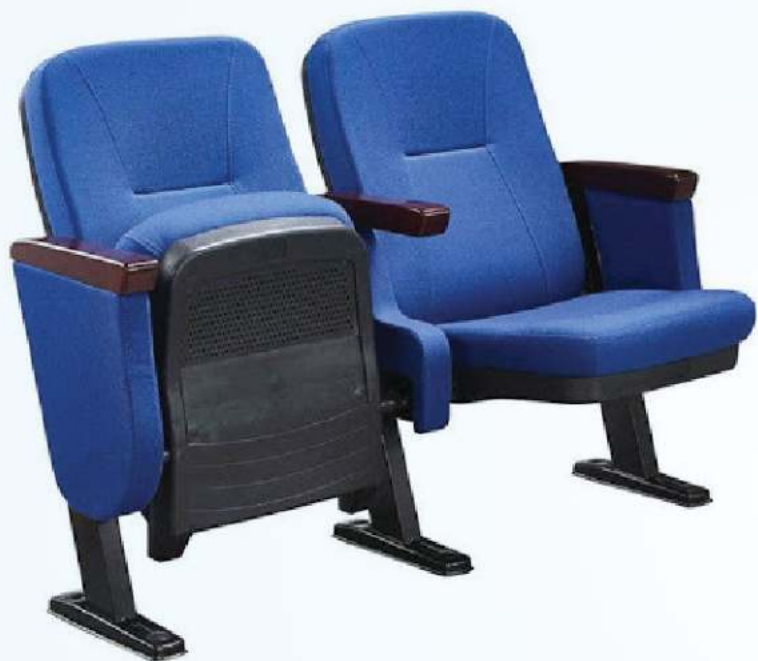
Auditorium chair STO-WB436FF