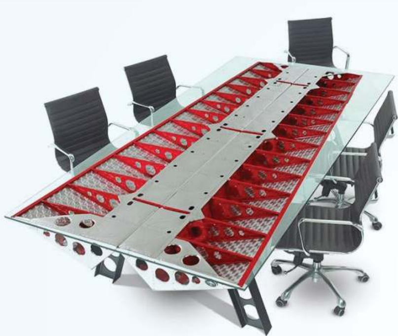
Conference Table STO-CT422MS