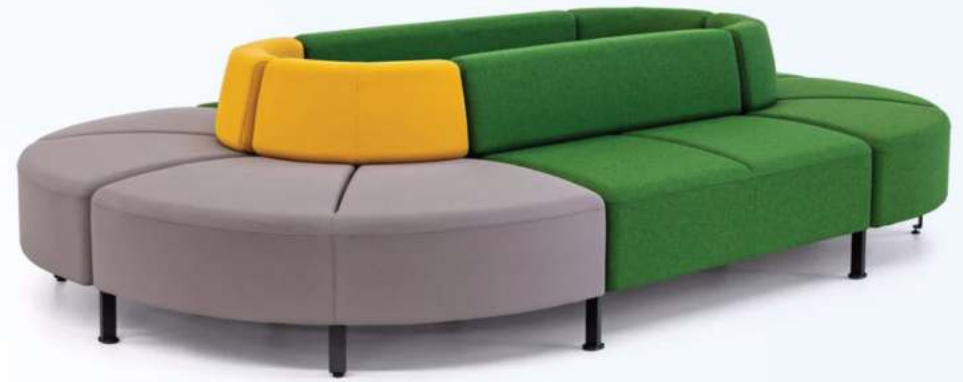
Modular Bench STO-WB436FF