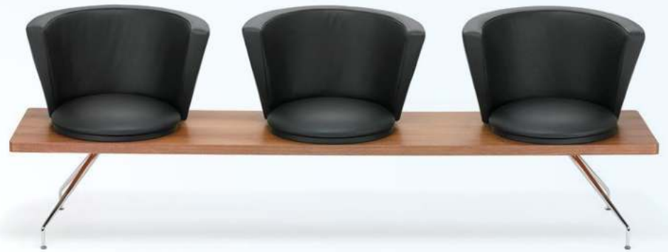
3-Seater Chair STO-WC426WD