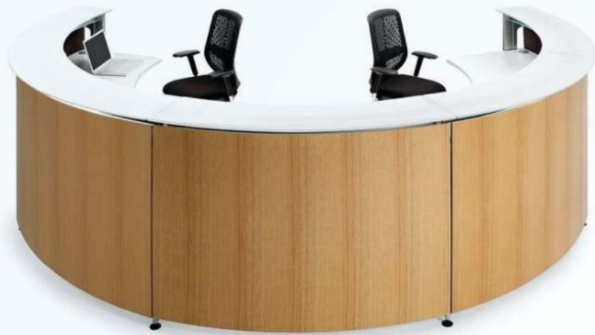
Modular Reception Desk STO-00D400LB