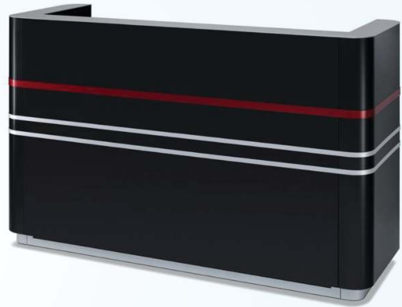
Reception Desk STO-00D401WD