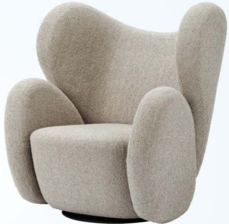
Arm Chair STO-SS301FF