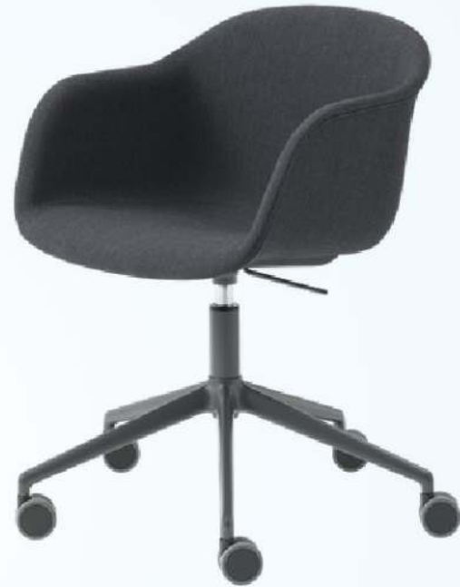
Executive Chair STO-CC078F