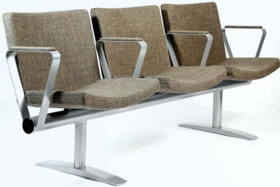
3-Seater Chair STO-WC425MS