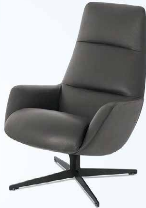
Executive Chair STO-CC201FR