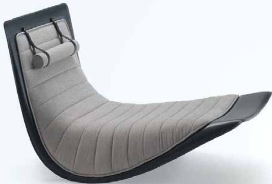
Arm Chair STO-CC202FF