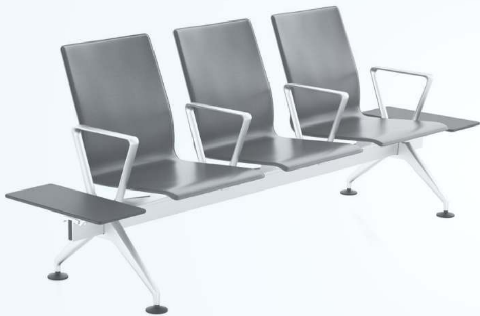
Waiting Bench STO-WC427WD