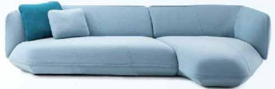
3 Seater Crooked Sofa