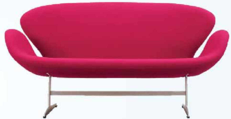
Mid Century Sofa