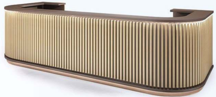
Reception Desk STO-00D403WD