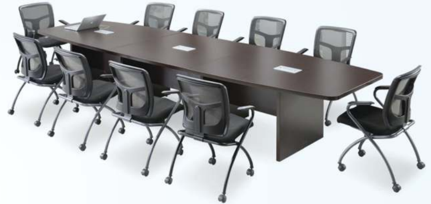
Conference Table STO-CT421LB