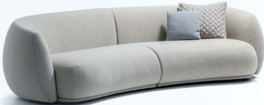
3 Seater Cambered Sofa