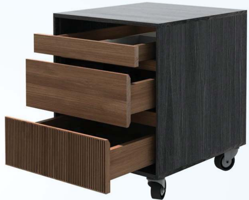
Movable Drawer Unit STO-0F371LB