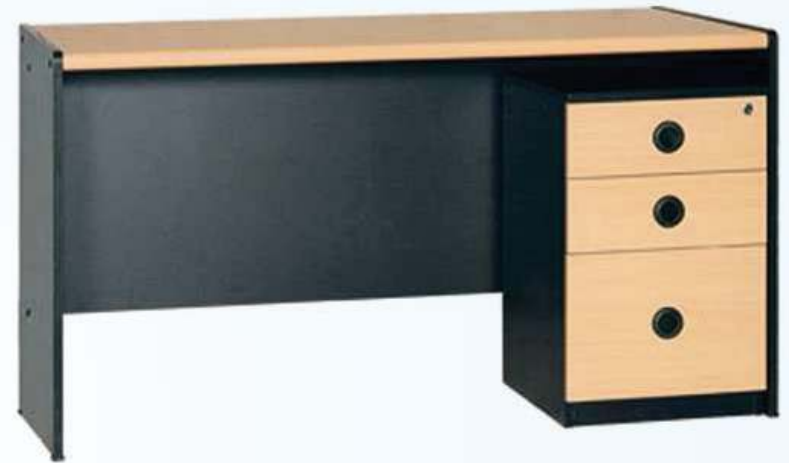
Executive Table STO-OET016LB