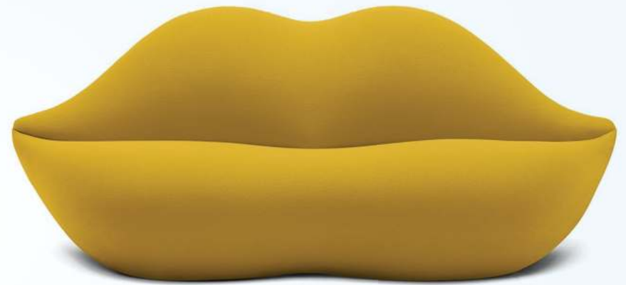
Lipseat Sofa STO-2-40F STO-2-40R