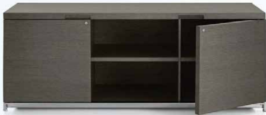
Low Height Cabinet STO-OS320LB