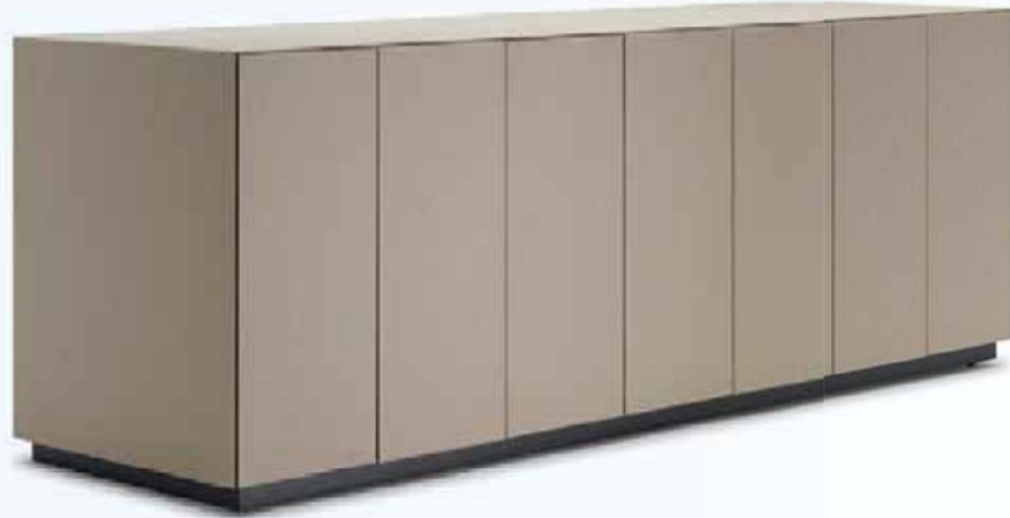
Low Height Cabinet STO-0S322LB