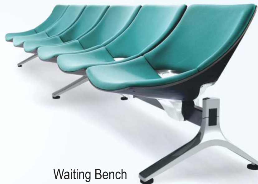
Waiting Bench STO-WC428WD