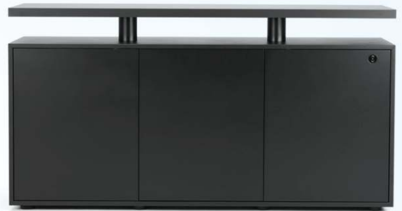
Side Table STO-Os321LB