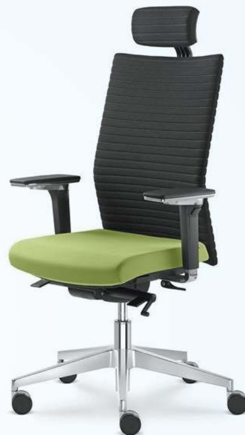
Executive Chair STO-OEC101FR