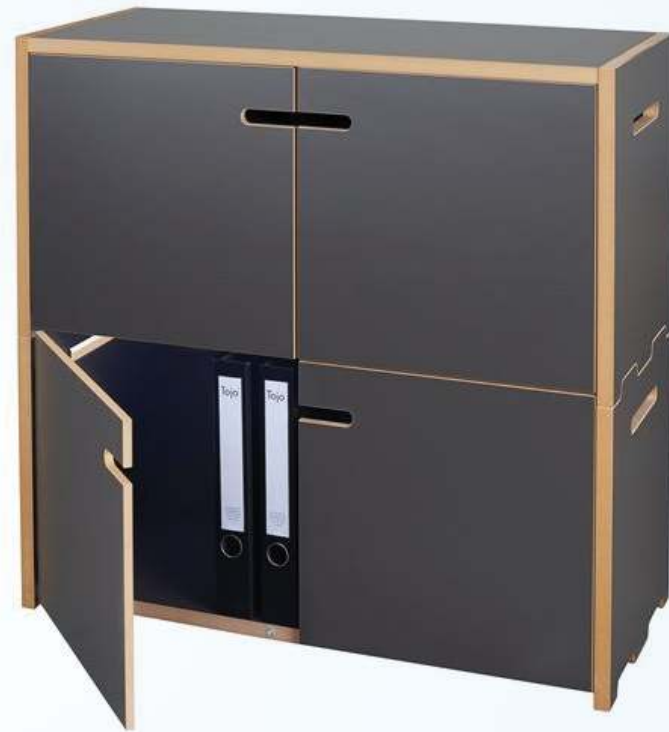
Side Rack STO-OR325LB