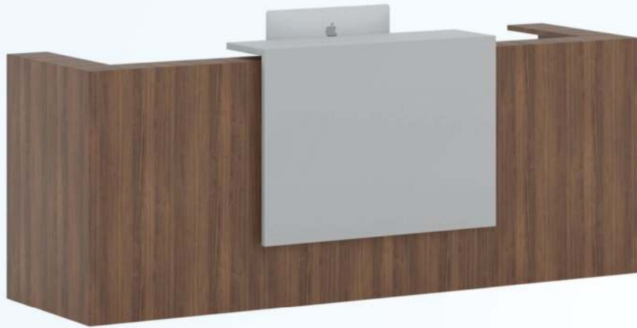
Reception Desk STO-00D402WD