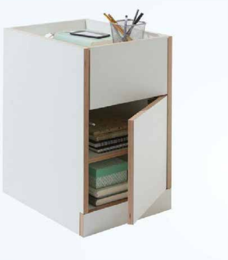
Drawer Unit STO-0F370LB