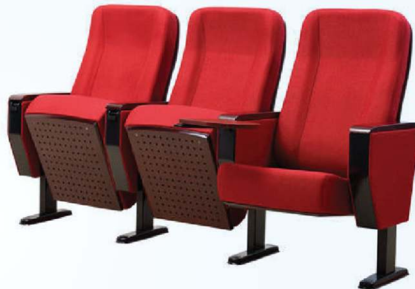
Auditorium chair STO-WB437FF