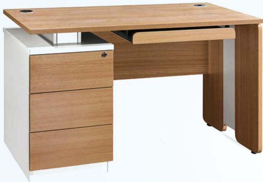
Executive Table STO-OET017LB