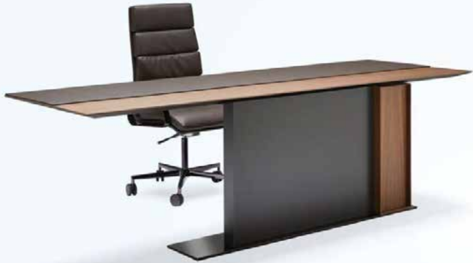
Executive Desk With Drawers STO-TD006WD