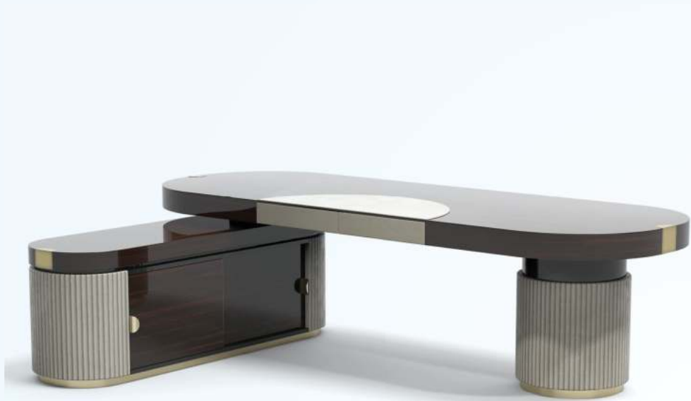
Corner Wooden Writing Desk STO-TD001WD