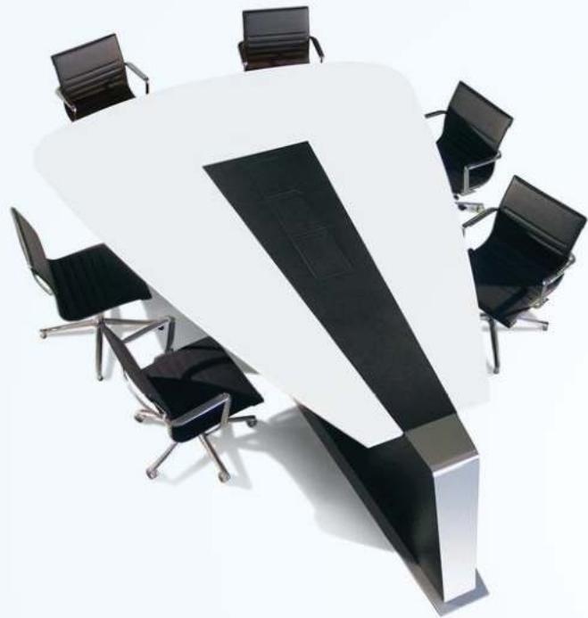
Conference Table STO-CT424WD