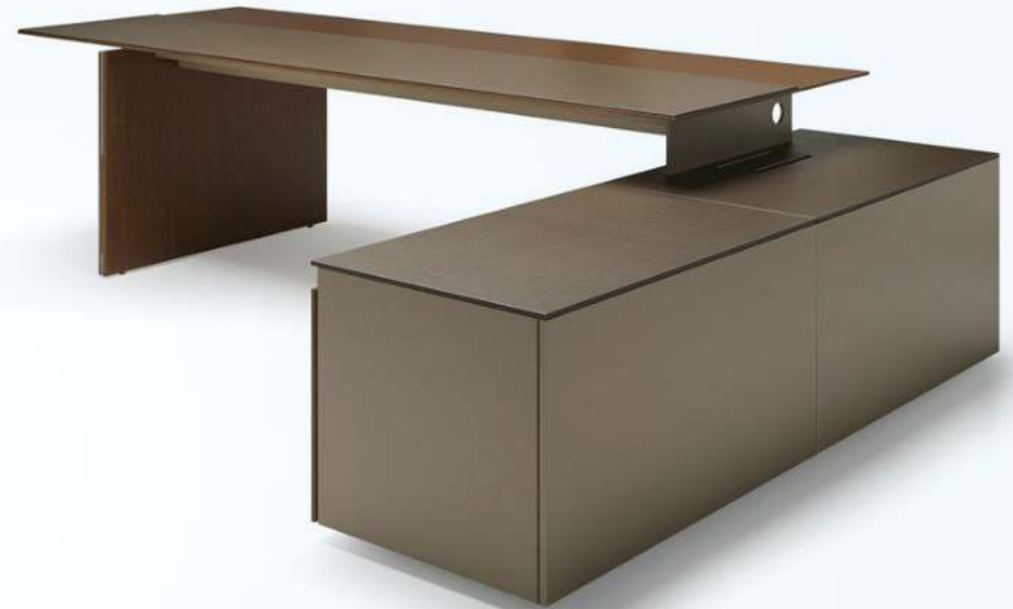
Executive Writing Desk STO-TD009WD