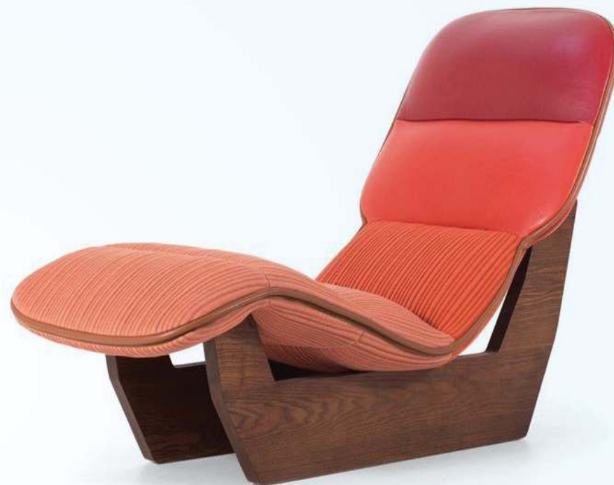
Arm Chair STO-CC203FF