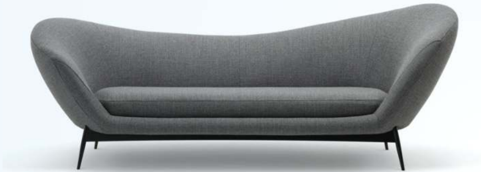
21st Century Sofa