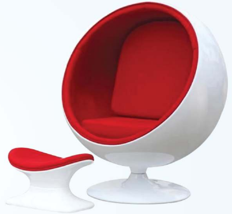
Arm Chair STO-CC210FF