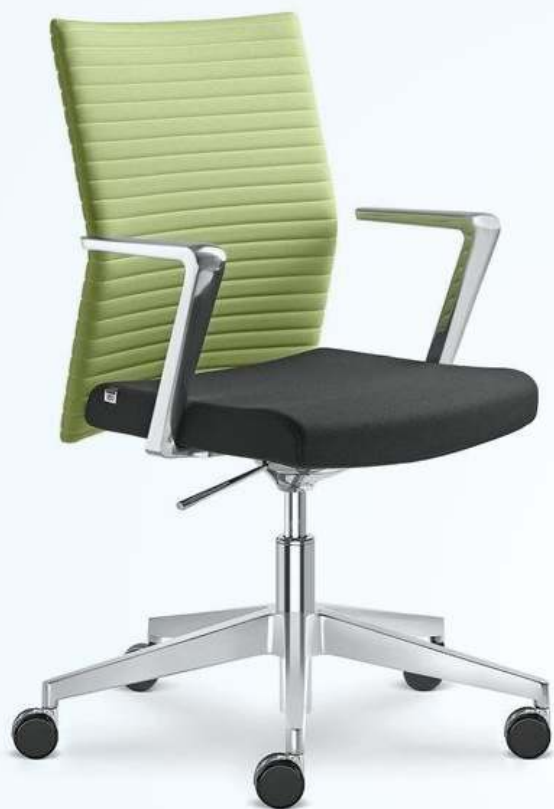
Executive Chair STO-OEC100FR