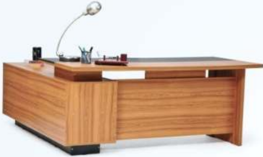
Executive Desk With Drawers STO-TM010LB