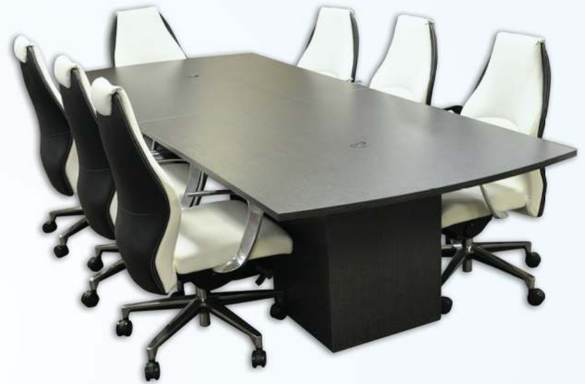
Conference Table STO-CT423WD