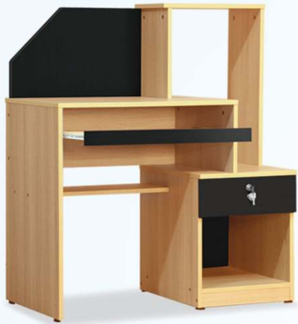
Computer Table STO-CT019LB