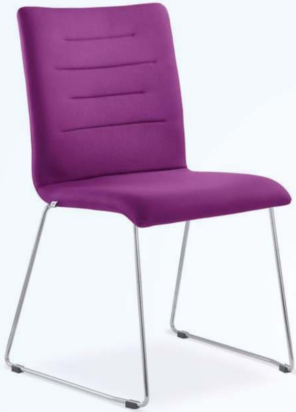
Executive Chair STO-OVC0078FR