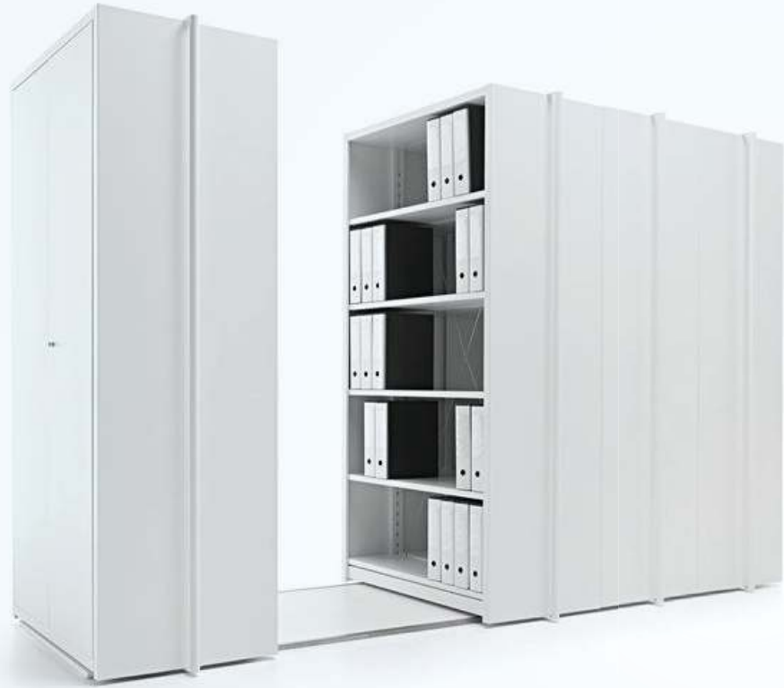
Compactable Cabinet STO-0S350MS