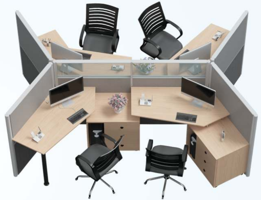
Office Work Station STO-OD021LB