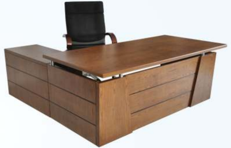
Manager Table With Drawers STO-TD011WD