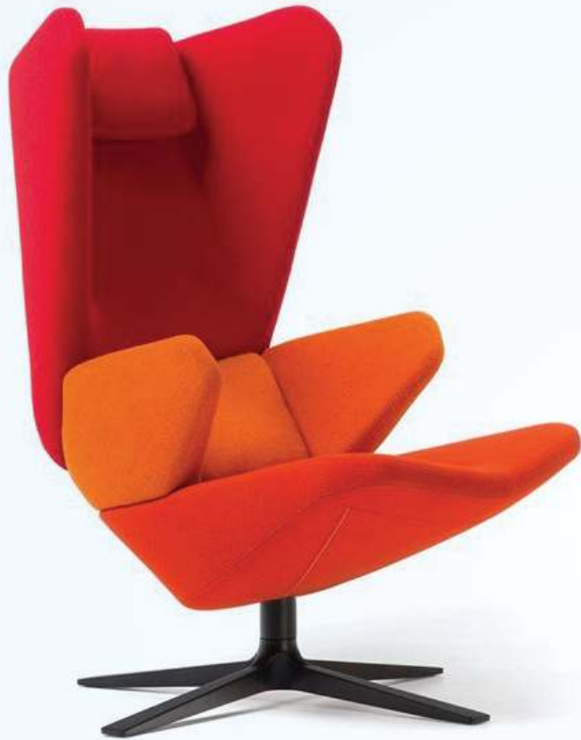
Executive Chair STO-CC200FF