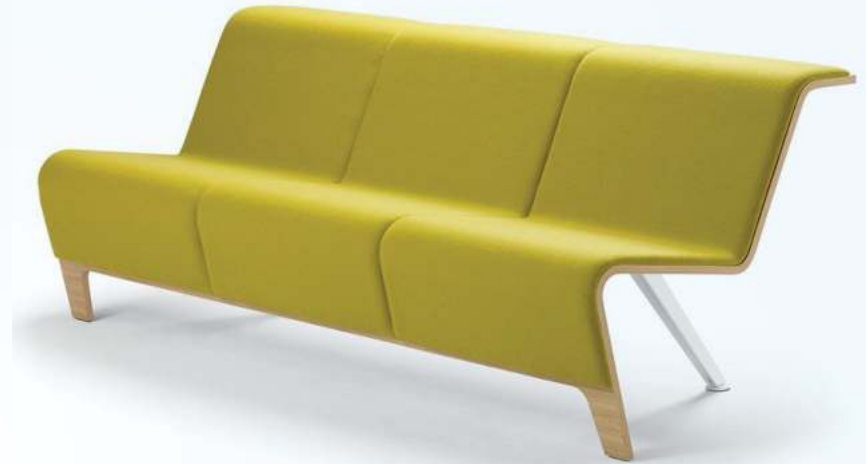
Waiting Bench STO-WC431FF