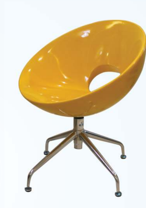
Executive Chair STO-CC076P