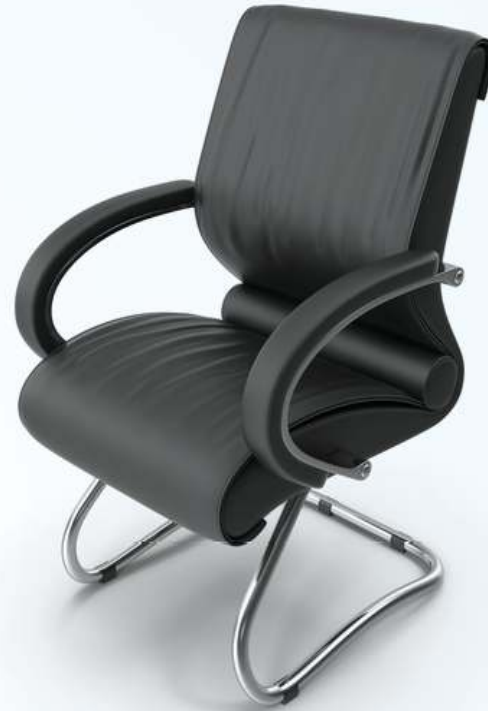
Executive Chair STO-OVC070R