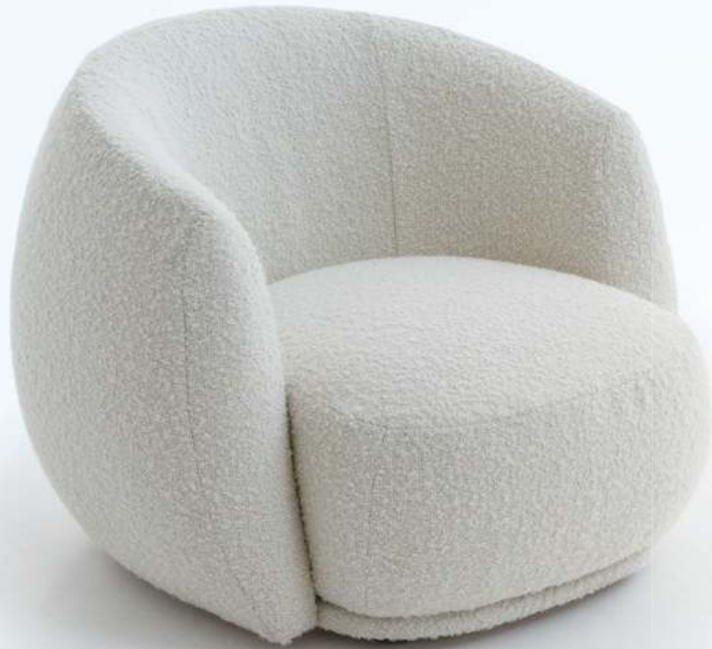
Arm Chair STO-SS300FF