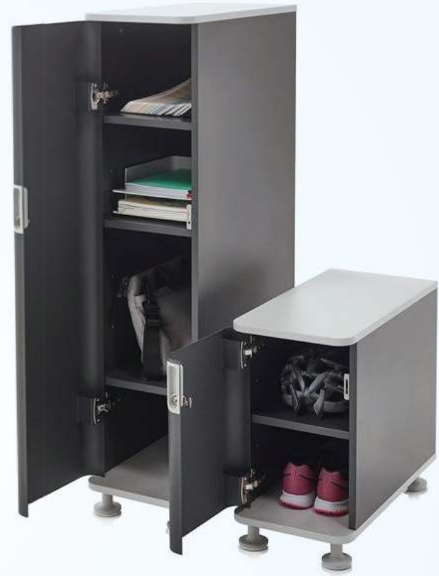
Office Storage STO-0S351MS