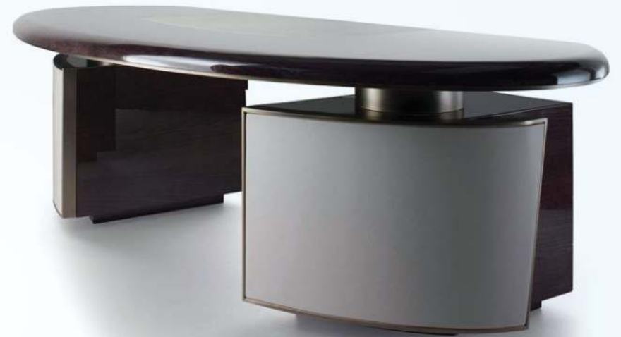
Executive Writing Desk STO-TD002WD