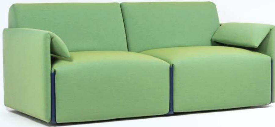
Love Seat sofa