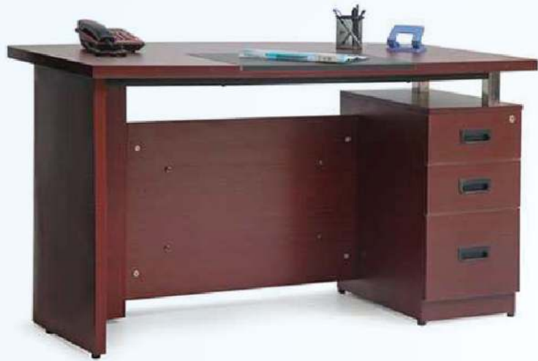
Executive Table STO-OET013LB