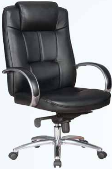
Executive Chair STO-ODC050R