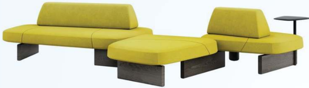
Waiting Bench STO-WC430FF