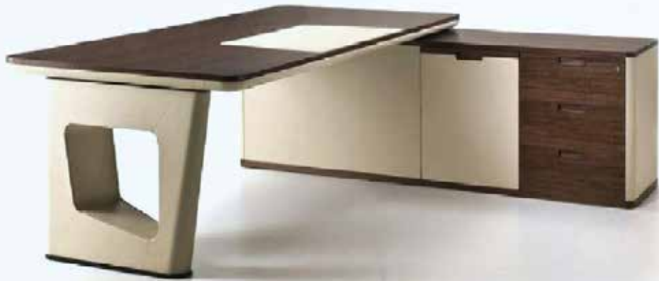
Corner Wooden Writing Desk STO-TD008WD