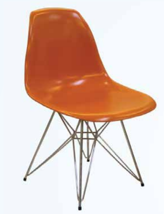
Executive Chair STO-CC075P