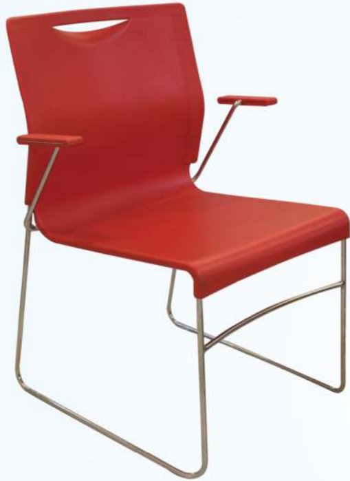
Executive Chair STO-OVC0077P