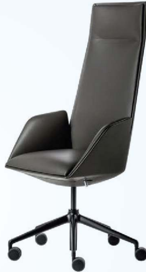
Executive Chair STO-ODC110FR