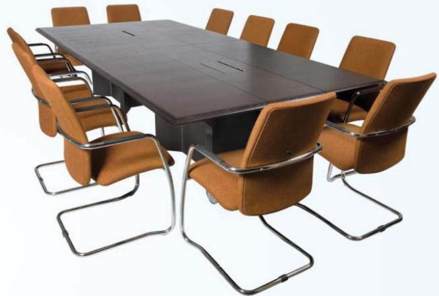
Conference Table STO-CT425WD