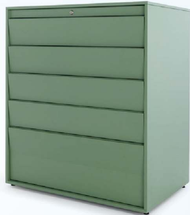
Drawer Unit STO-0F373MS