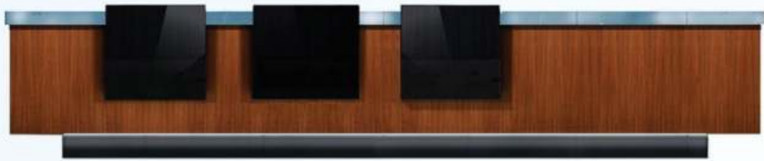
Reception Desk STO-00D4004WD