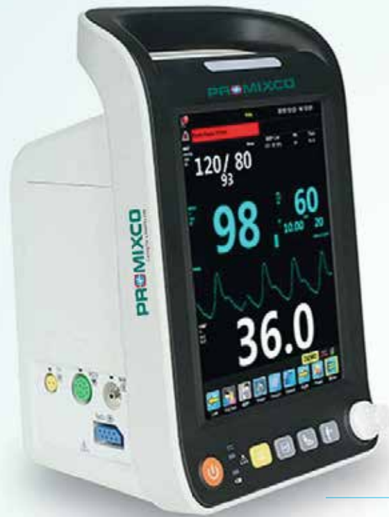
Table Top Pulse Oximeter